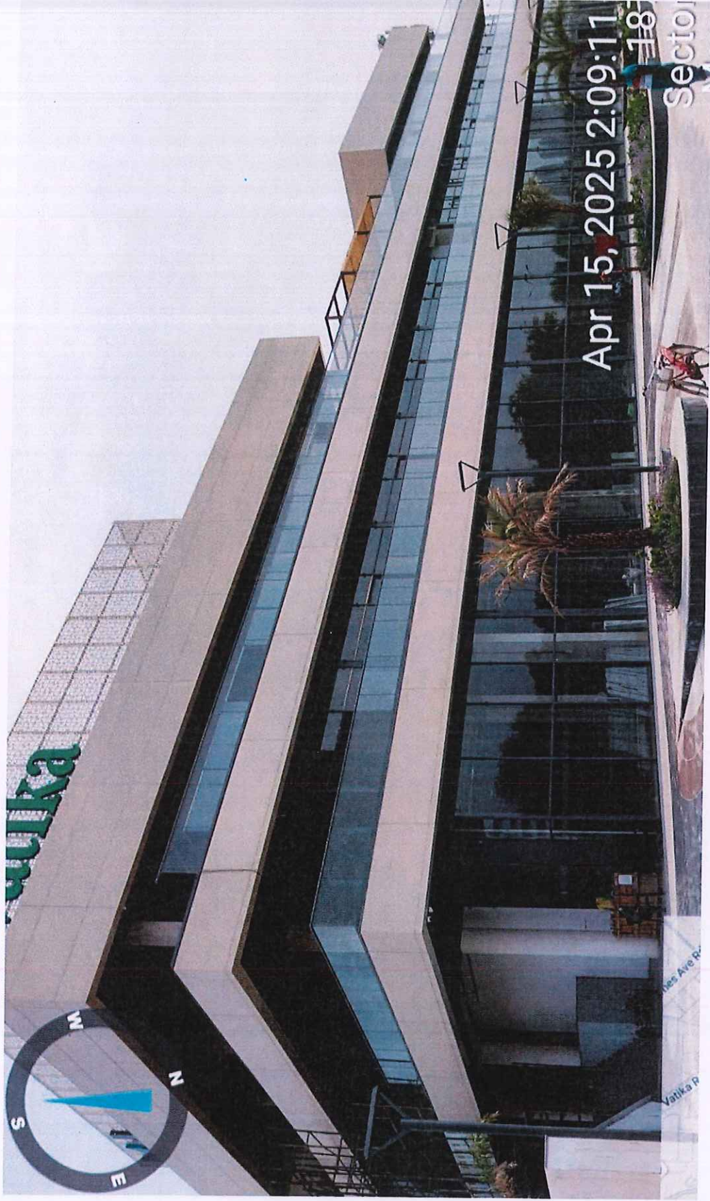
MARKET WALK EXTERNAL FAÇADE FINISHING WORK COMPLETED