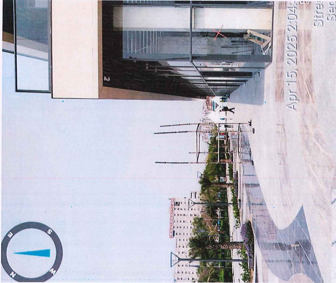
MARKET WALK EXTERNAL FLOOR FINISHING WORK COMPLETED