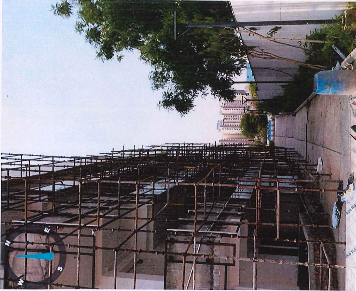
MARKET WALK EXTERNAL FINISHING WORK IN PROGRESS