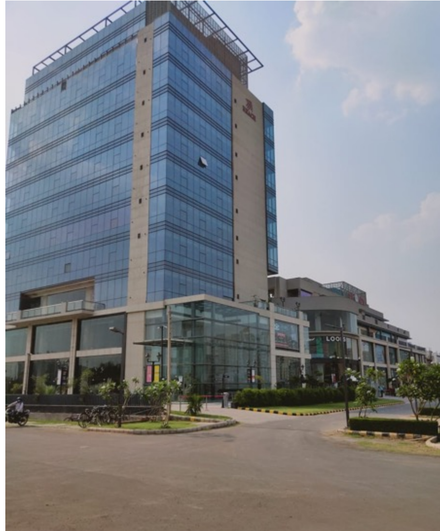
FRONT VIEW OF 'MY TOWER'