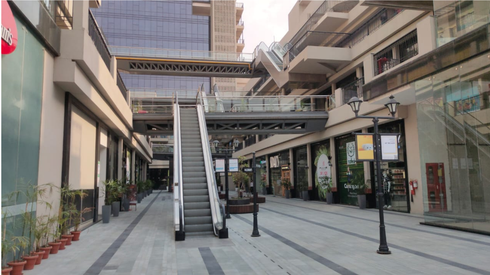
CENTRAL BOULEWARD AREA-1 WORK COMPLETED