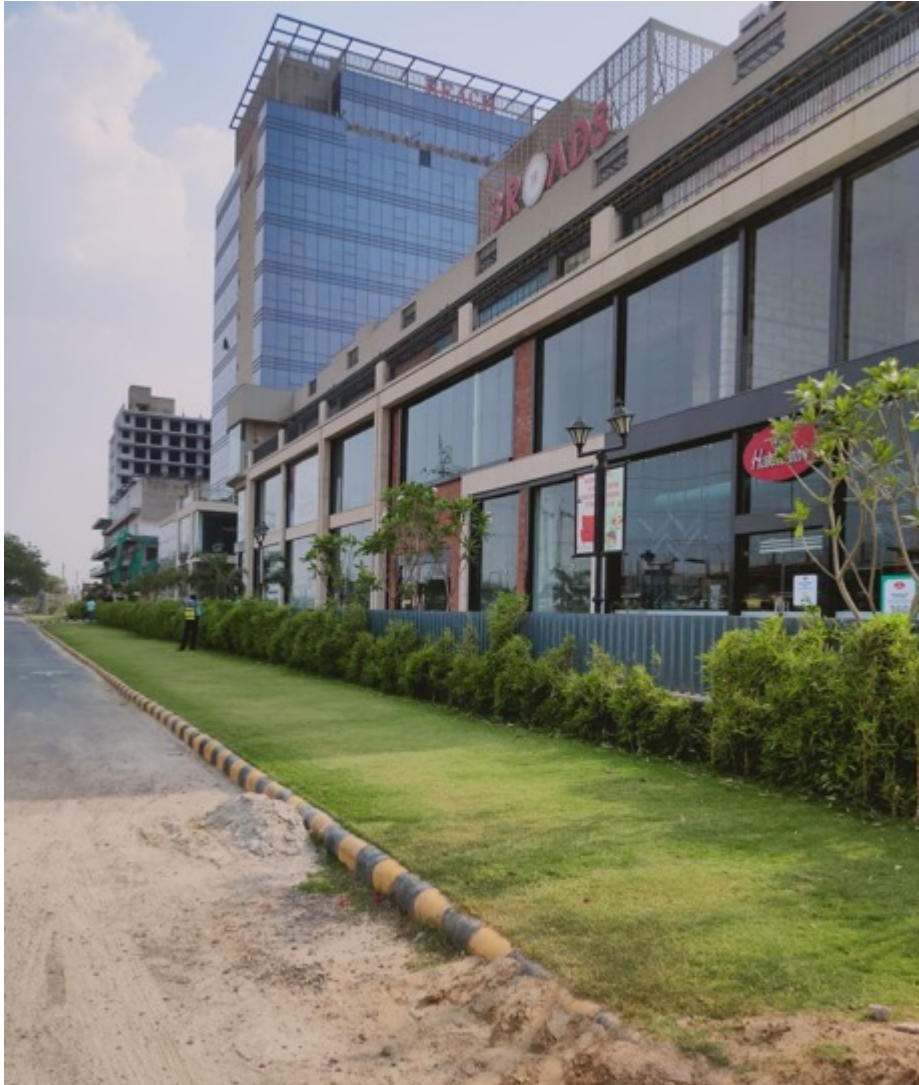
FRONT VIEW OF '3 ROADS'