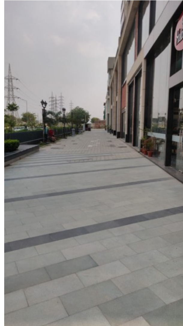
24 MTR ROAD SIDE AREA