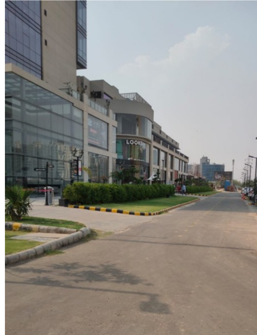
VIEW FROM 60 M ROAD