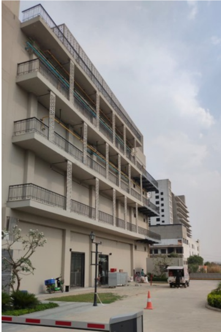
BACK VIEW OF '3 ROADS'