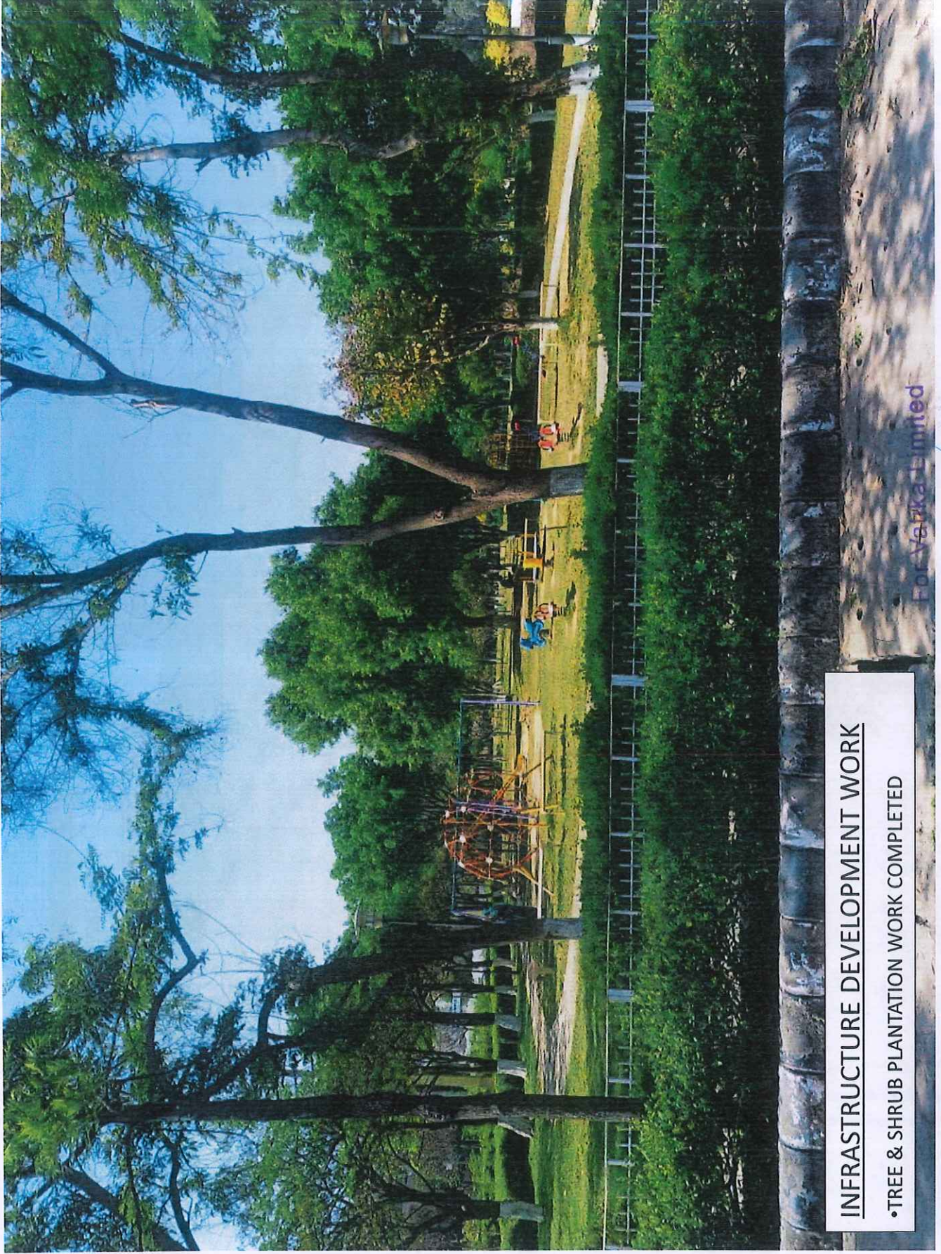
INFRASTRUCTURE DEVELOPMENT WORK • TREE & SHRUB PLANTATION WORK COMPLETED