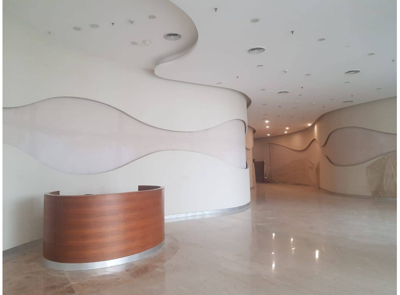
Main Lift Lobby