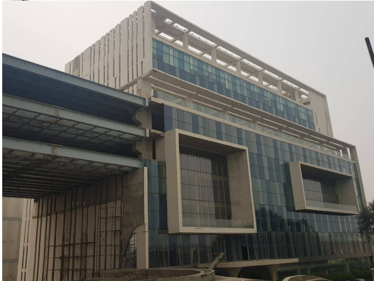
Tower D-East Elevation