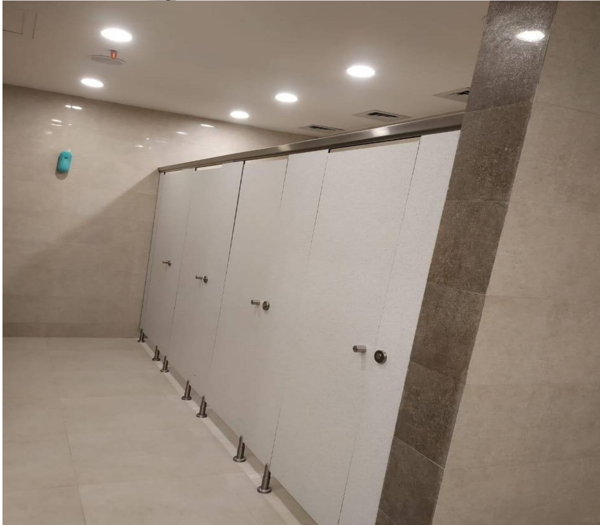
6 th Floor-Toilets