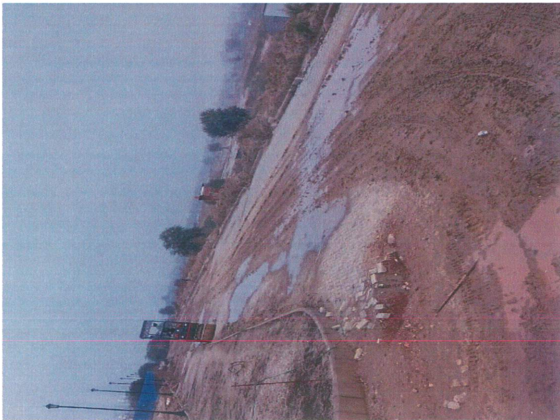
M3M SCC-113 PROGRESS PHOTO DEC-2020