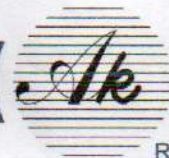
Table - A