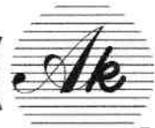
Table - A