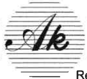
Table - A