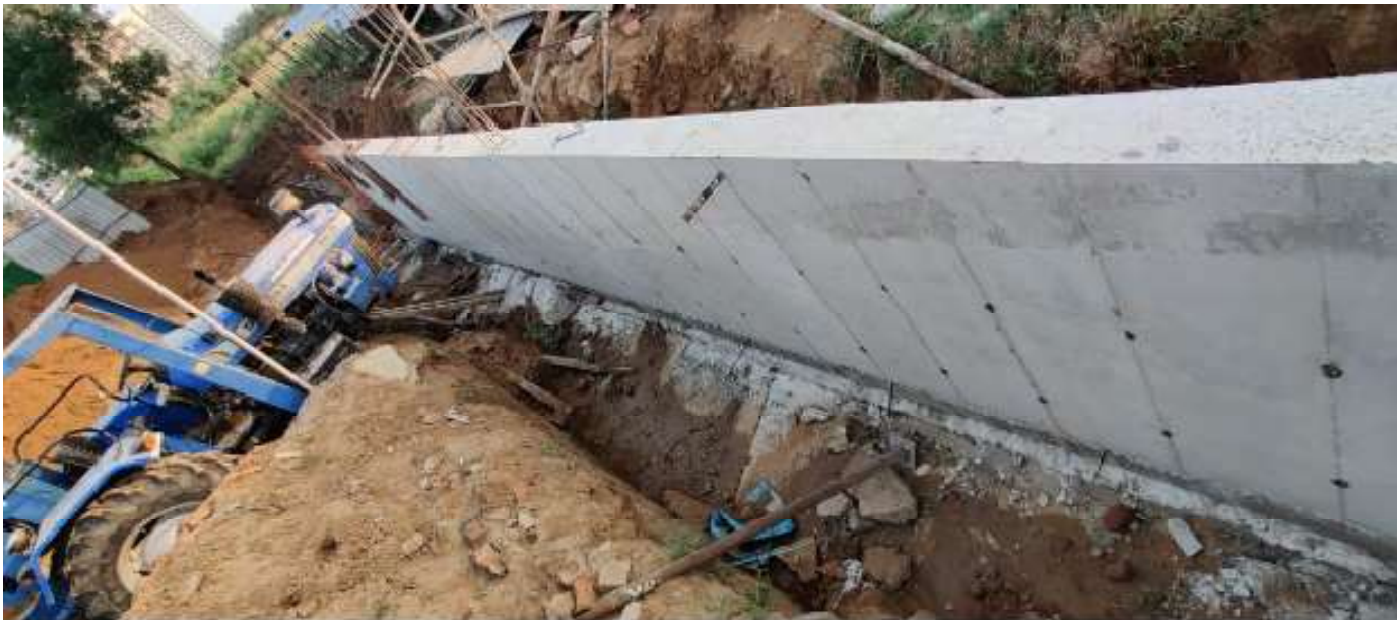
MARKET WALK COMPOUND WALL CONSTRUCTION IN PROGRESS