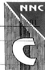
Table – C

HARYANA GOVT. GAZ. (EXTRA.), MAY 21, 2019 (VYSK. 31, 1941 SAKA)