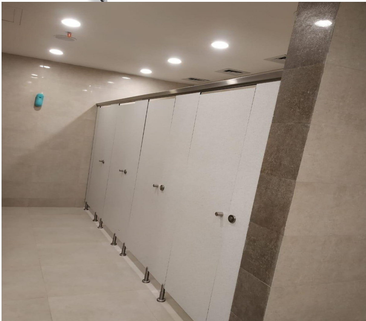
6 th Floor-Toilets