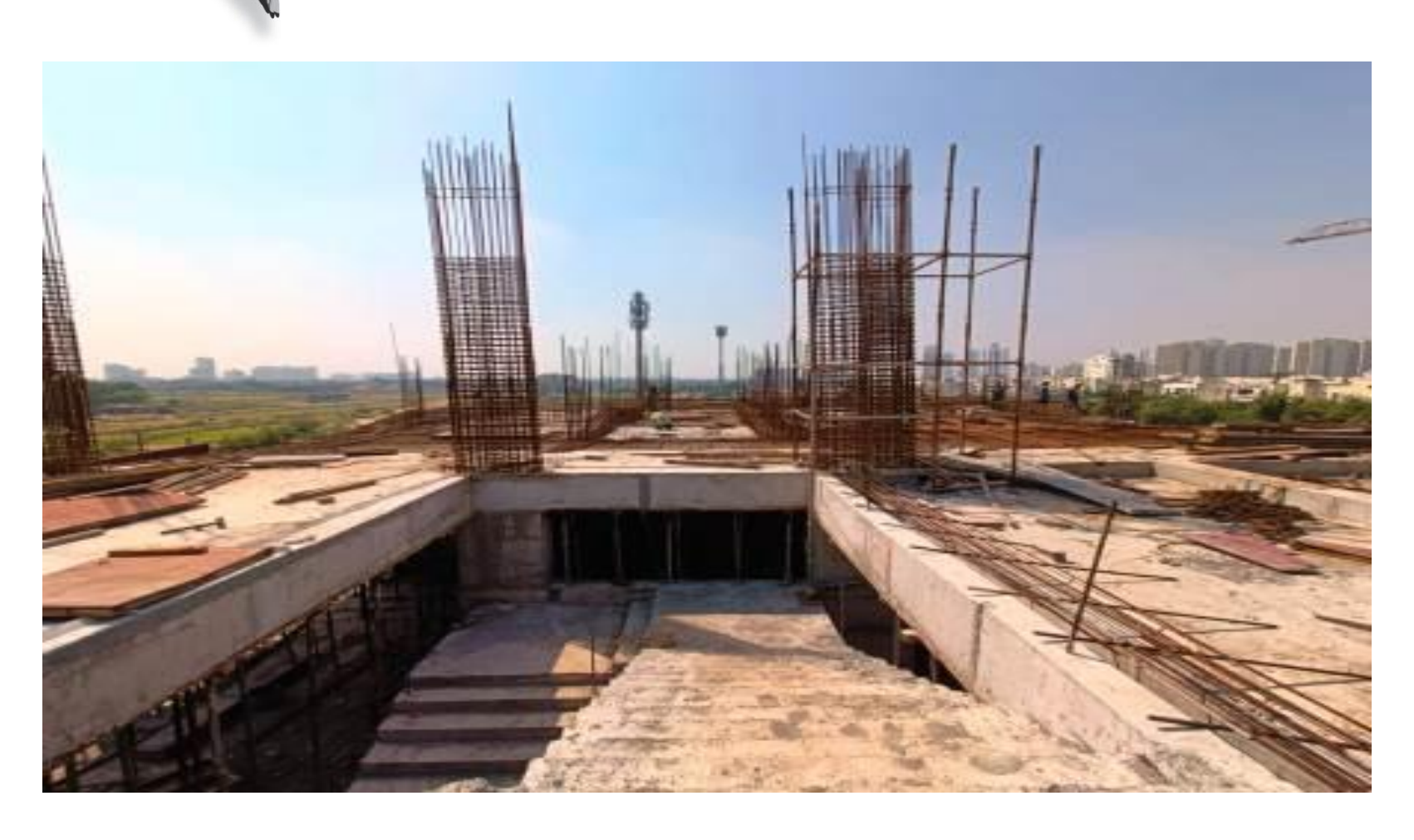
Staircase casting completed