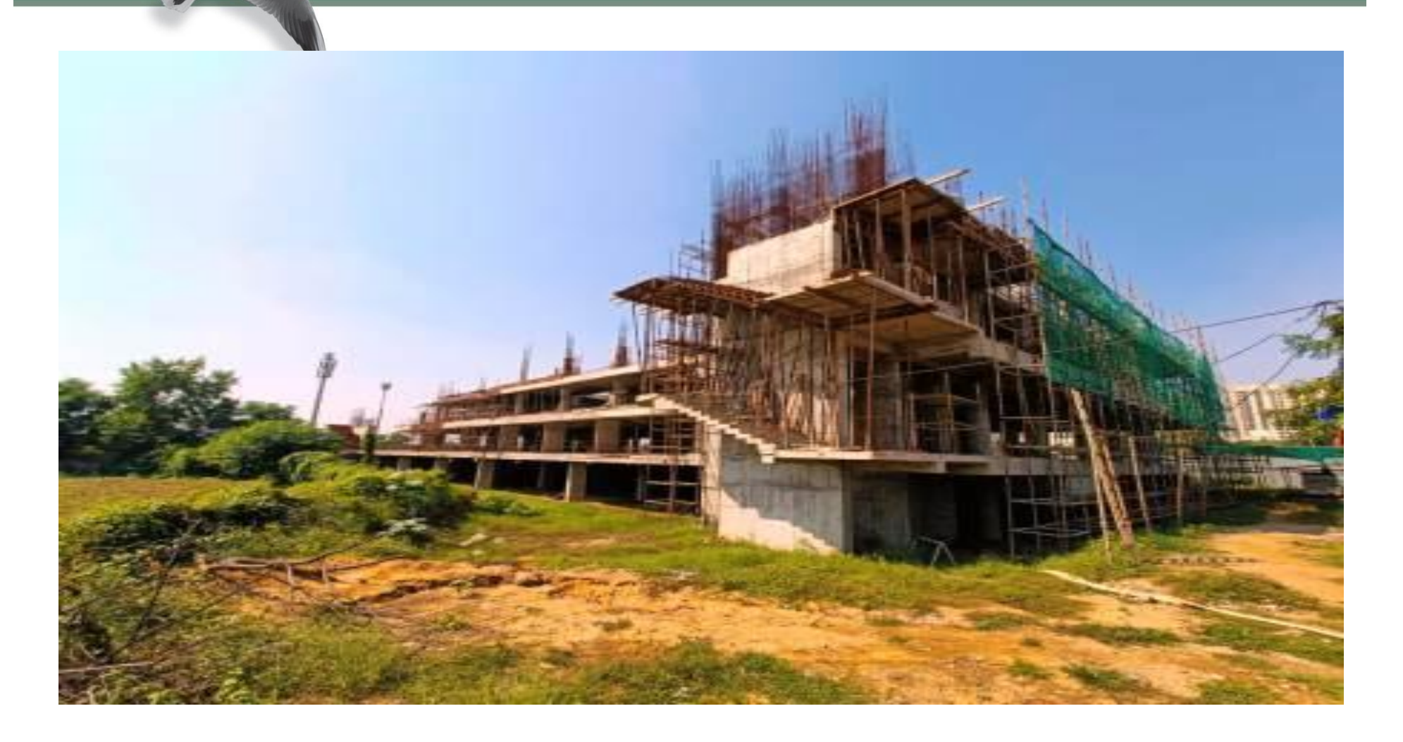
SF staircase casting in progress