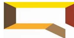
Table – C