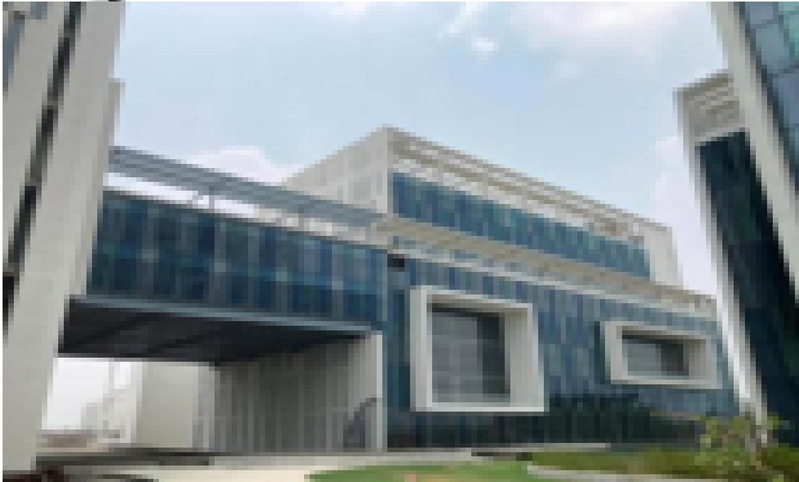
Tower D-East Elevation