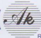
Table - A