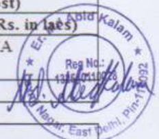
FOR OFFICE USE ONLY