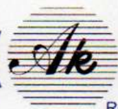
Table - A