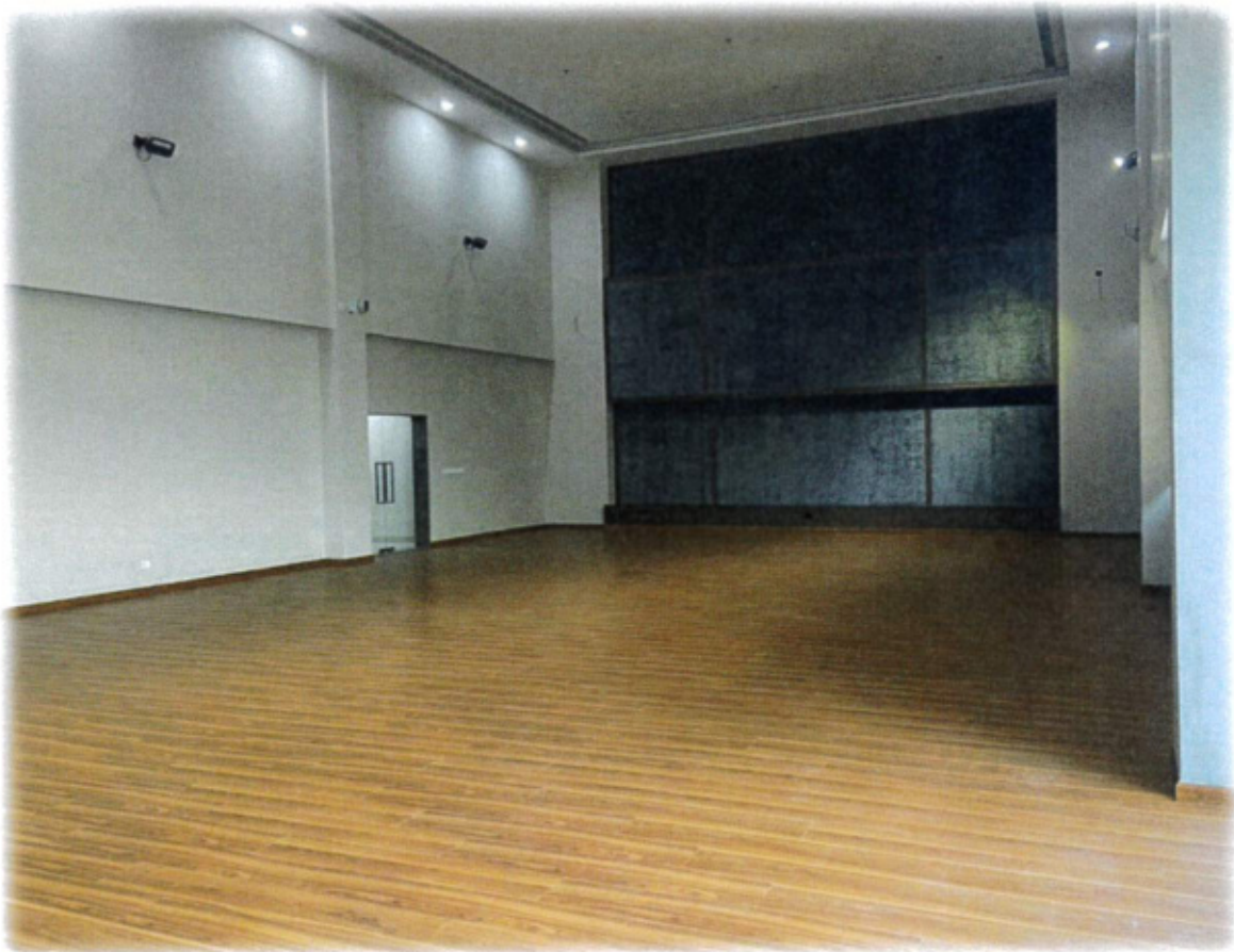
Multipurpose / badminton Hall