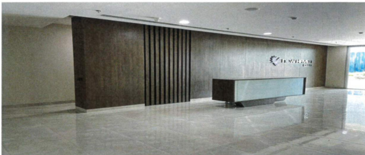
Community Building Entrance