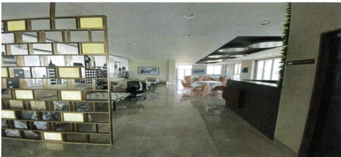
Juice & Sitting Area.