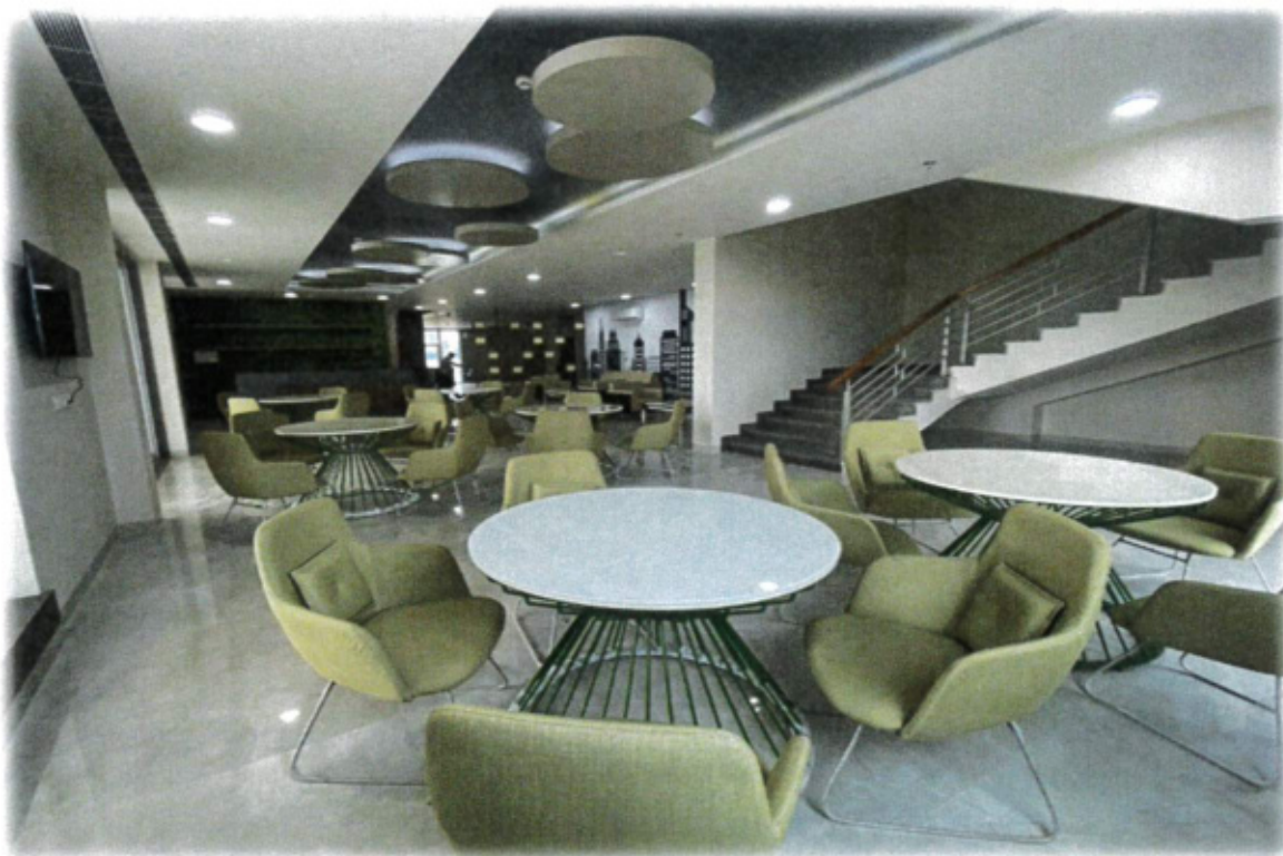
Juice Bar & Sitting Area