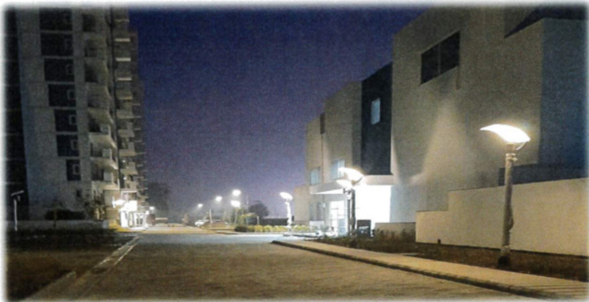
Club Entrance & View at night