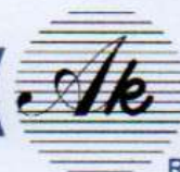
Table - A