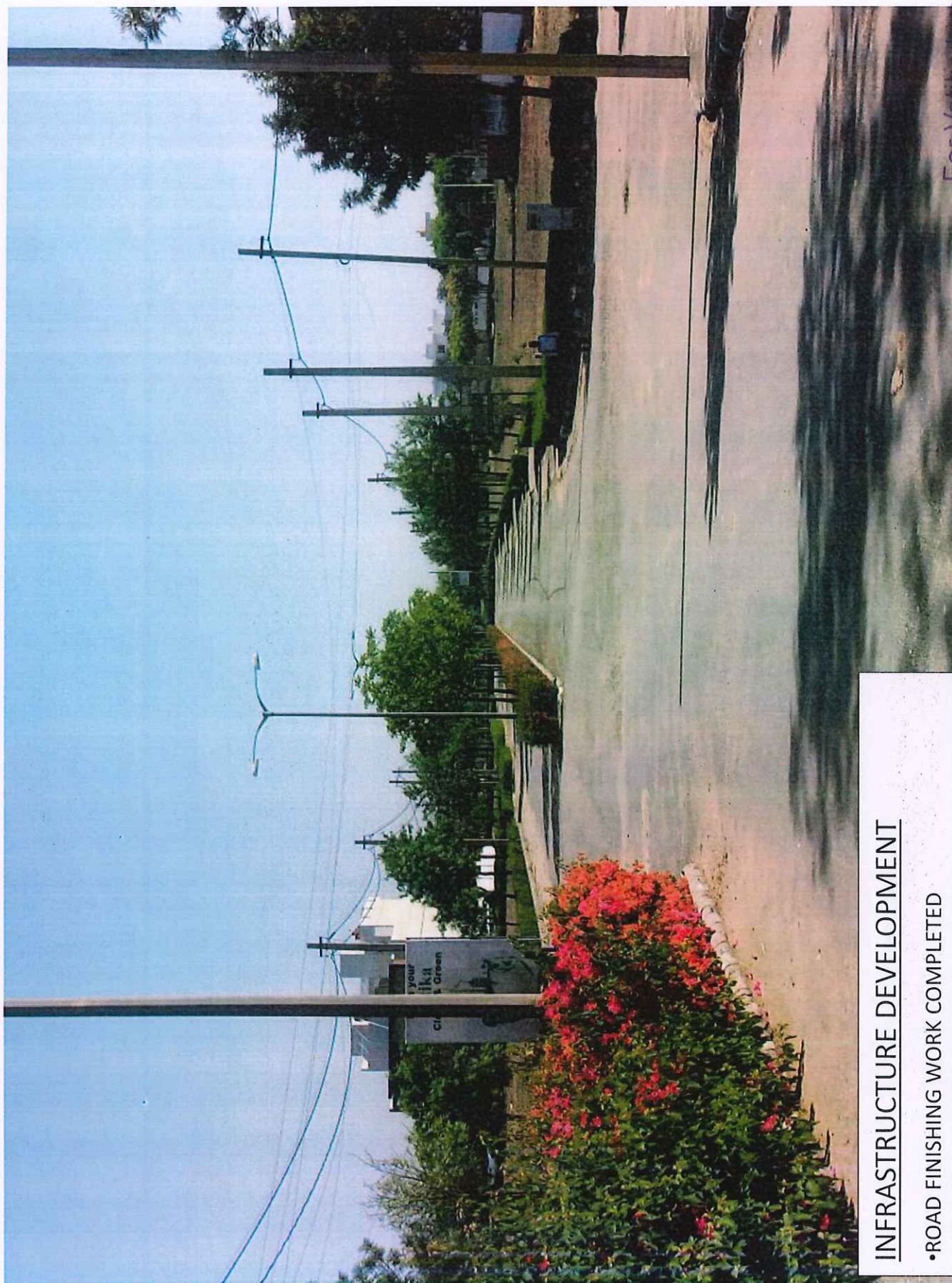
INFRASTRUCTURE DEVELOPMENT •ROAD FINISHING WORK COMPLETED