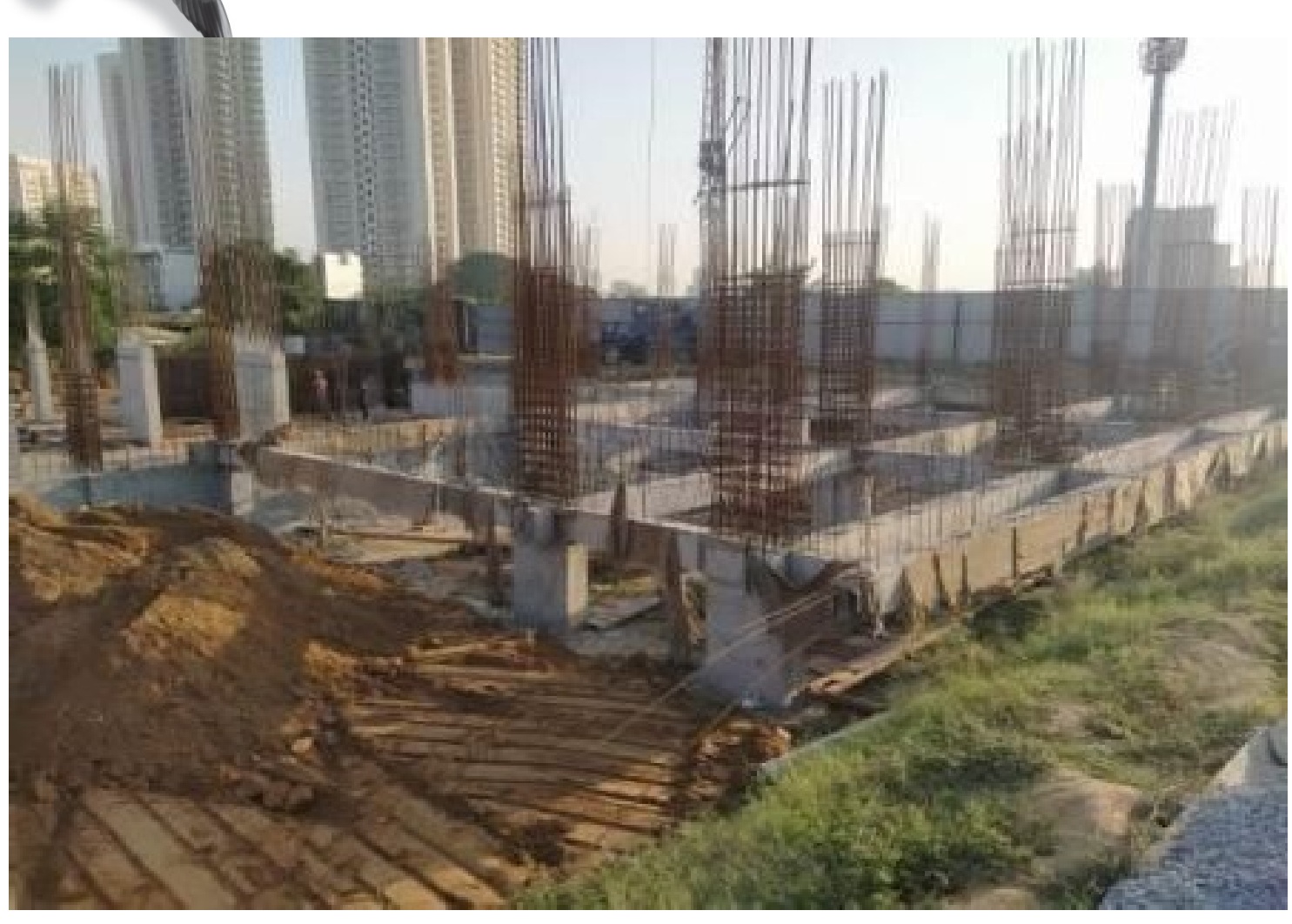
Backfilling work is on progress.