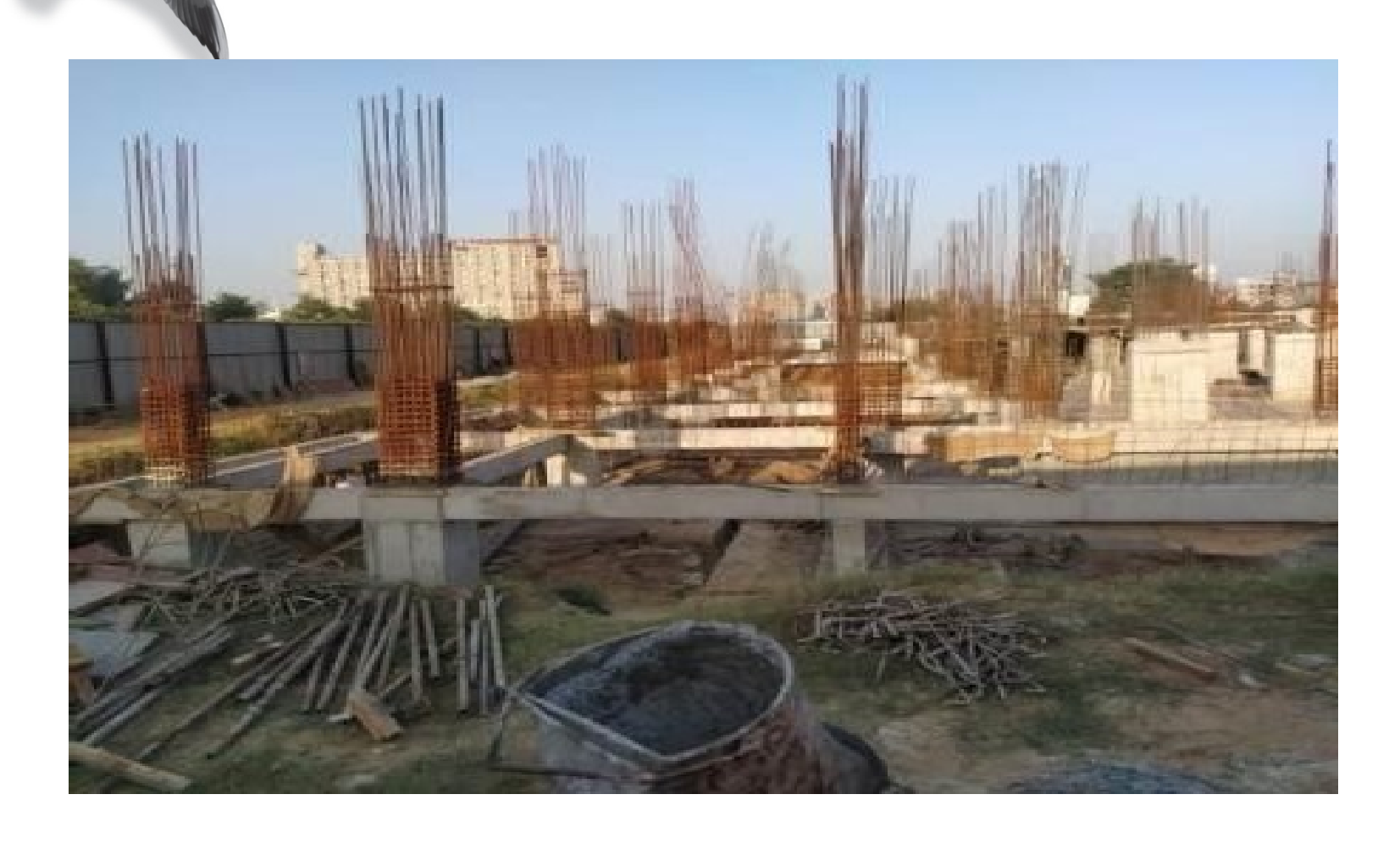
Column Reinforcement work is on progress.