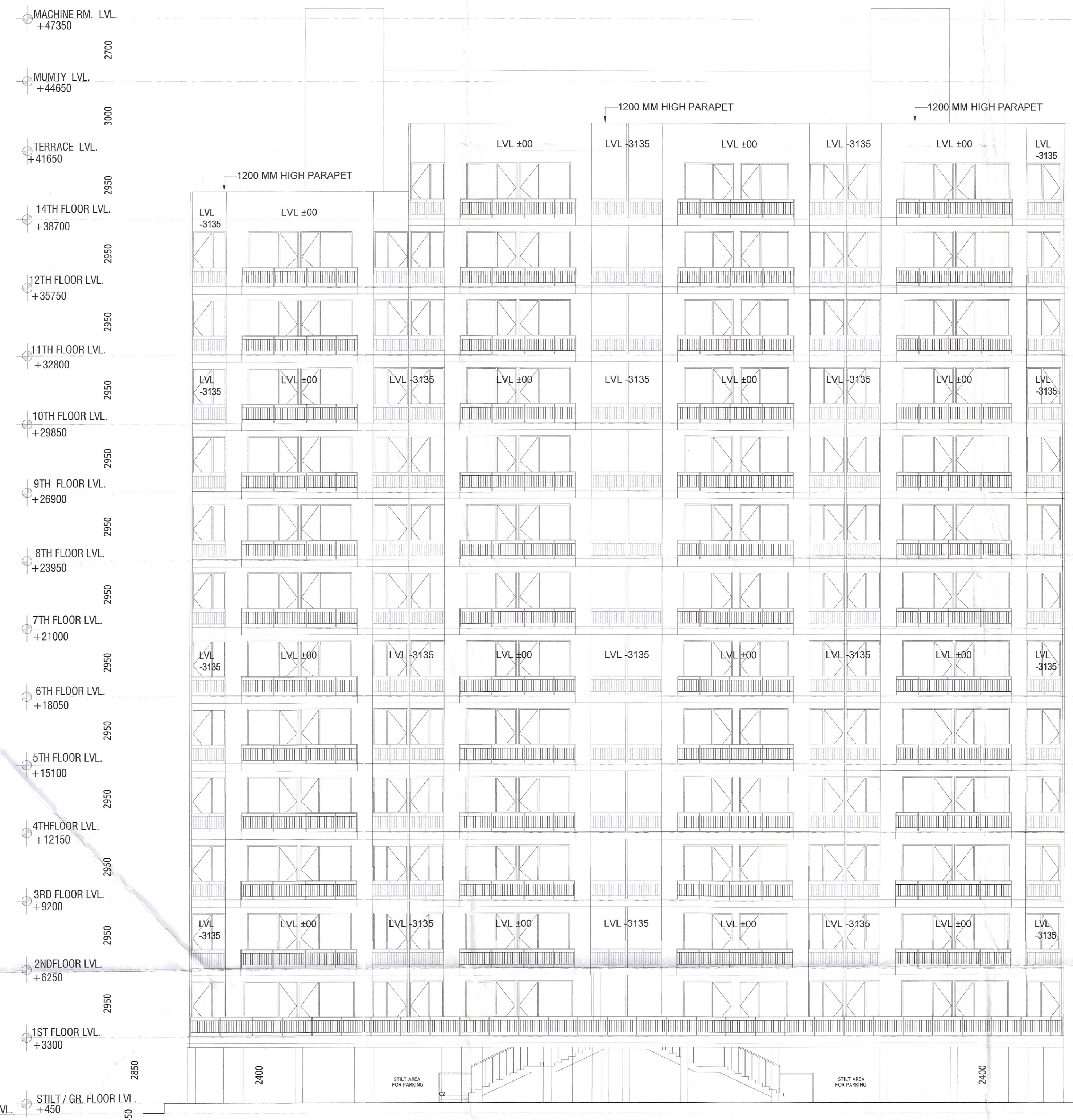
FRONT AND REAR ELEVATION TOWER- 01