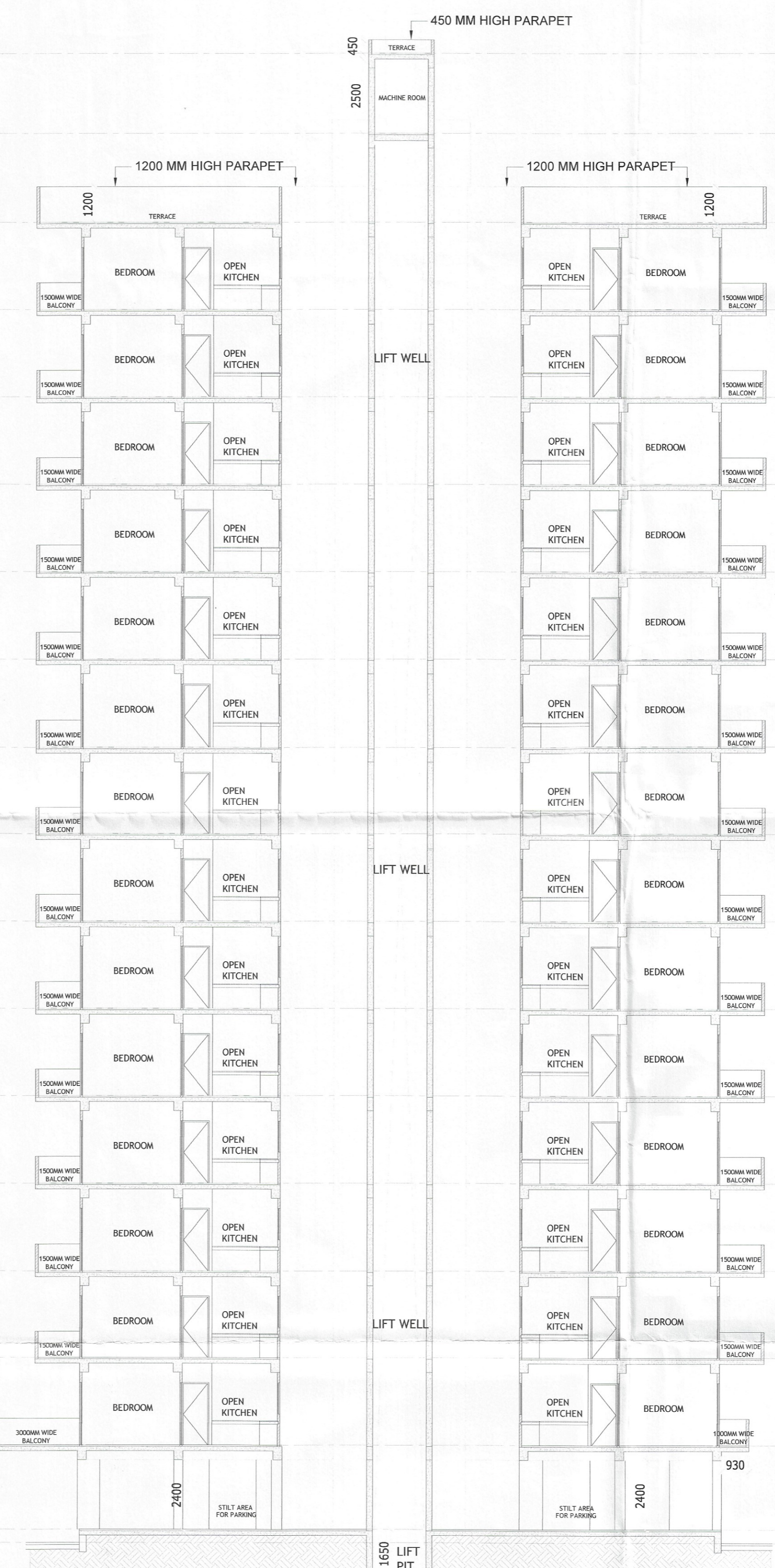
TYPICAL BUILDING SECTION -A TOWER-10&11,12 & 12A