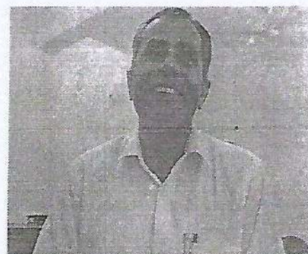
उप /संयुक्त पंचायत अधिकारी