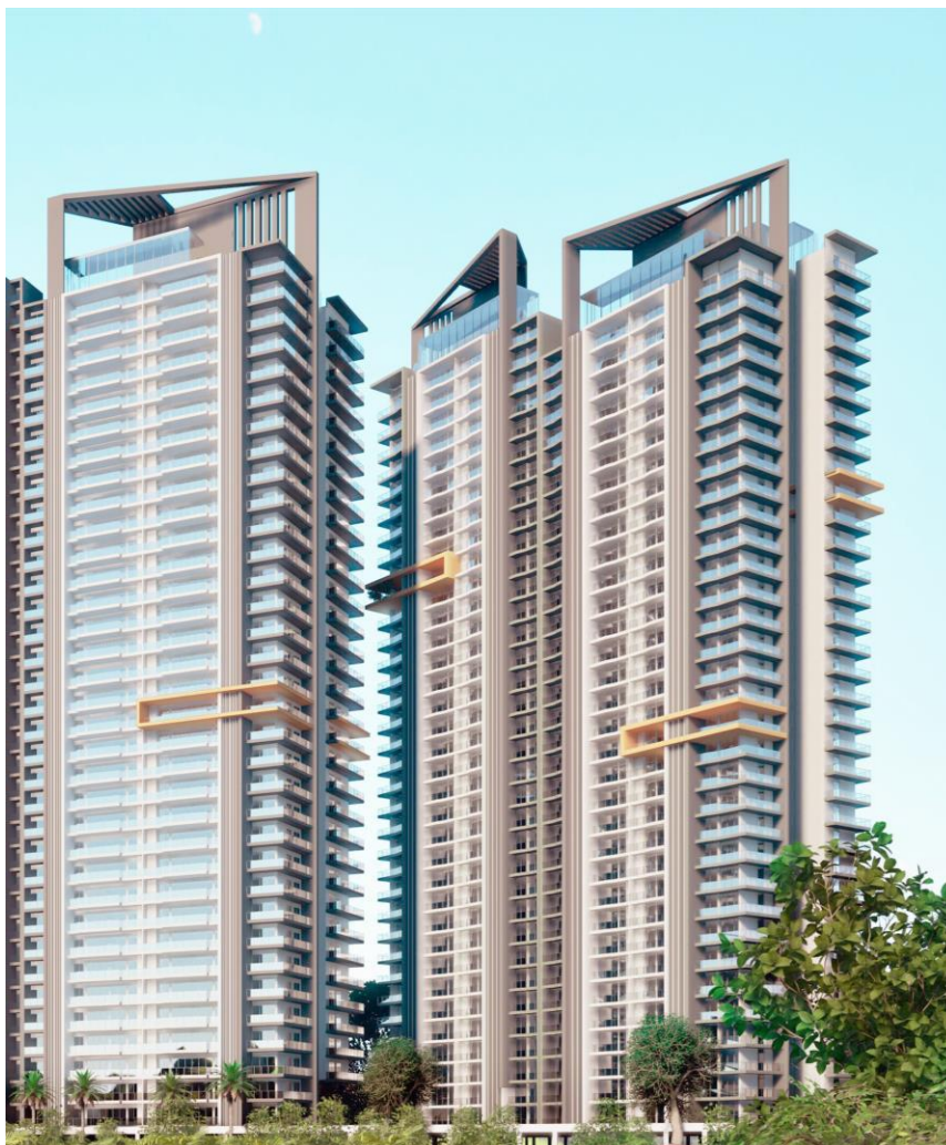
AR Figure 6- 3D view of 3BHK blocks