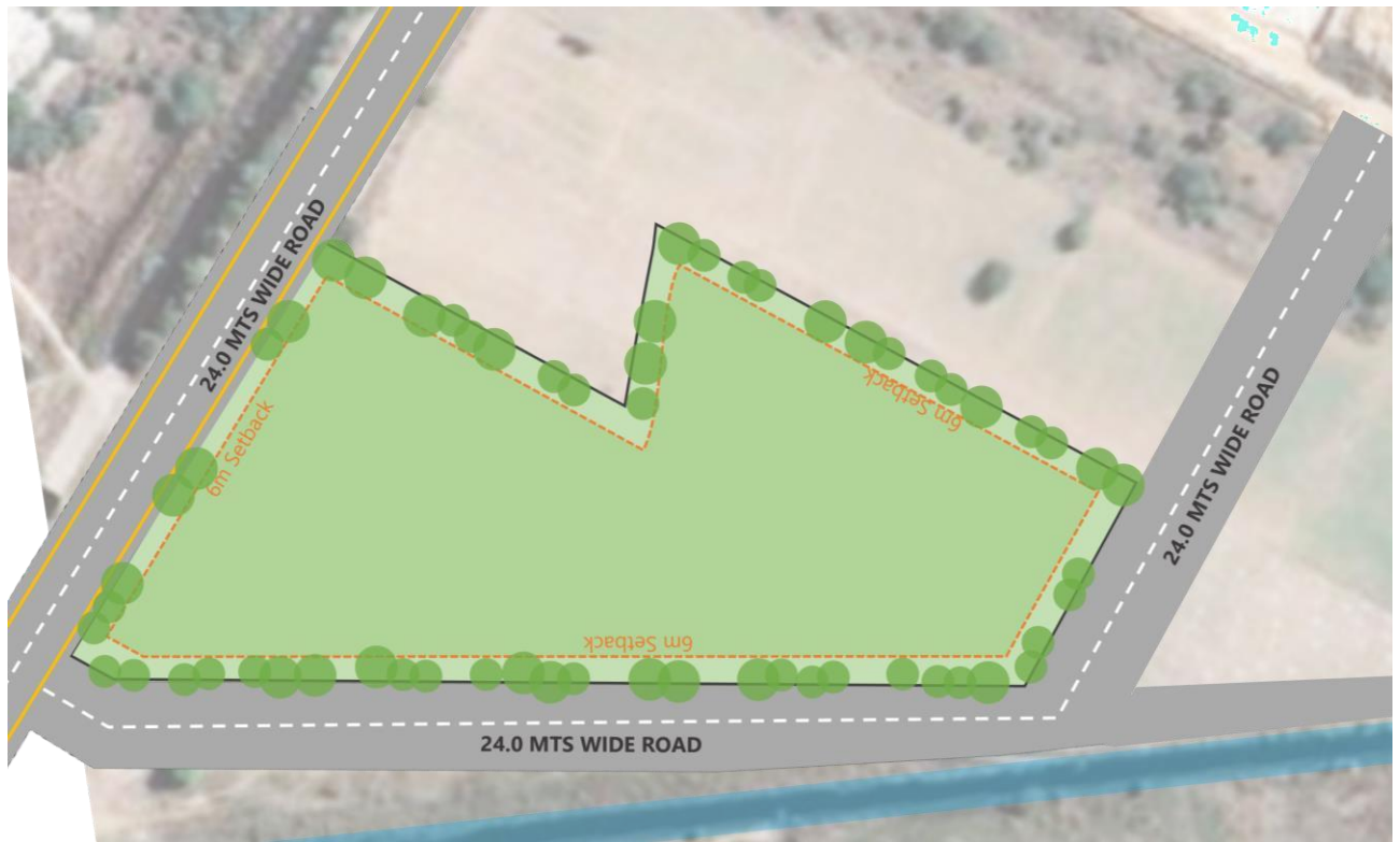
AR Figure 2- Proposed site zoning

A site area of 6.26 acres is to be developed initially for The Kingstown Height. The site sits on an important intersection with 24m wide road on the North and 24m wide road on West. Thus, the site has good road connectivity, which is crucial to the development of any Group housing.