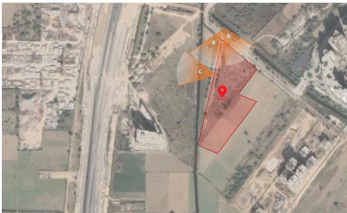
AR Figure 4-Key plan for site views