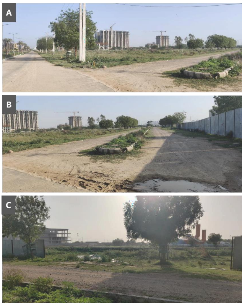
AR Figure 5- Site surrounding view