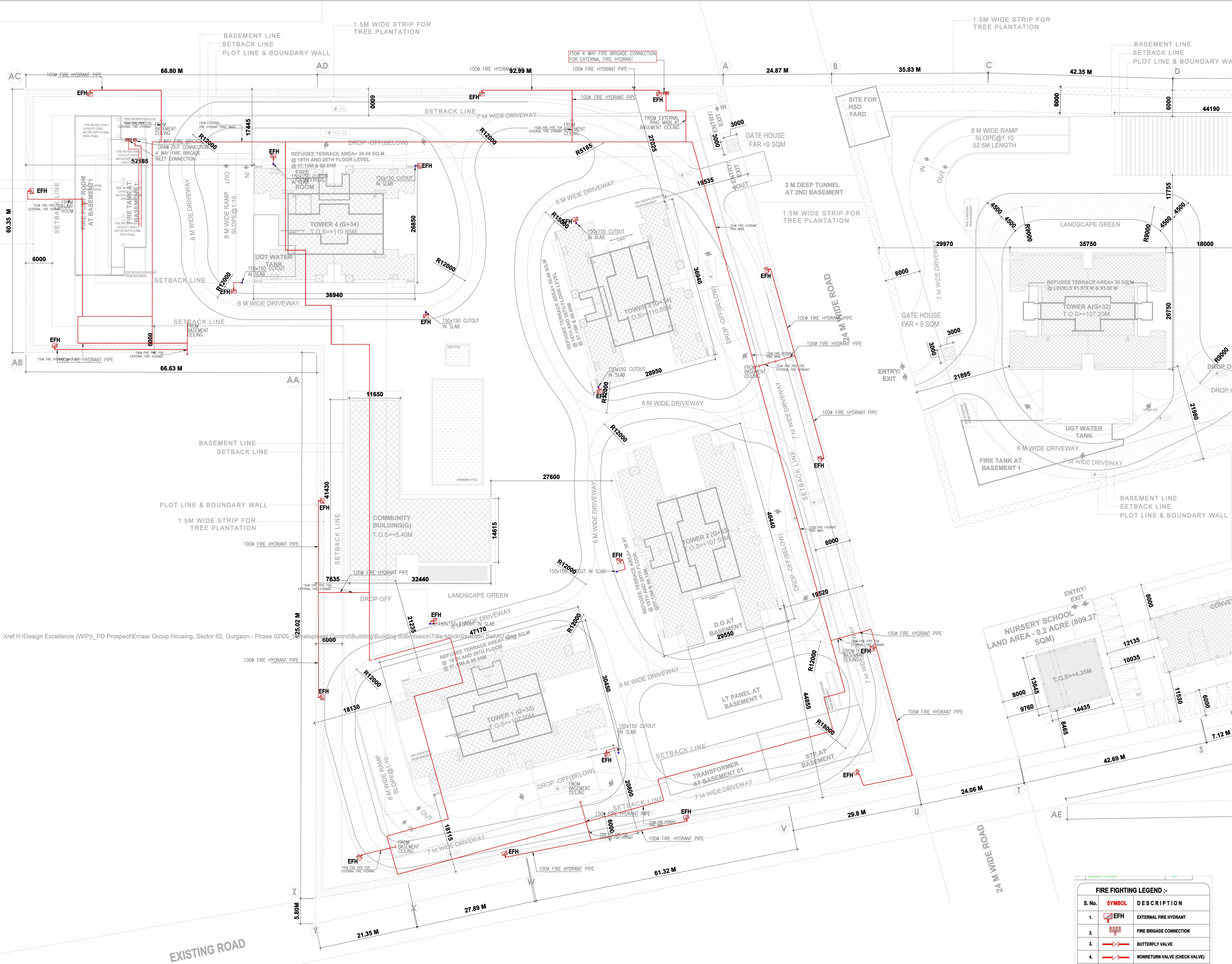
01 FIRE FIGHTING LAYOUT 1:400