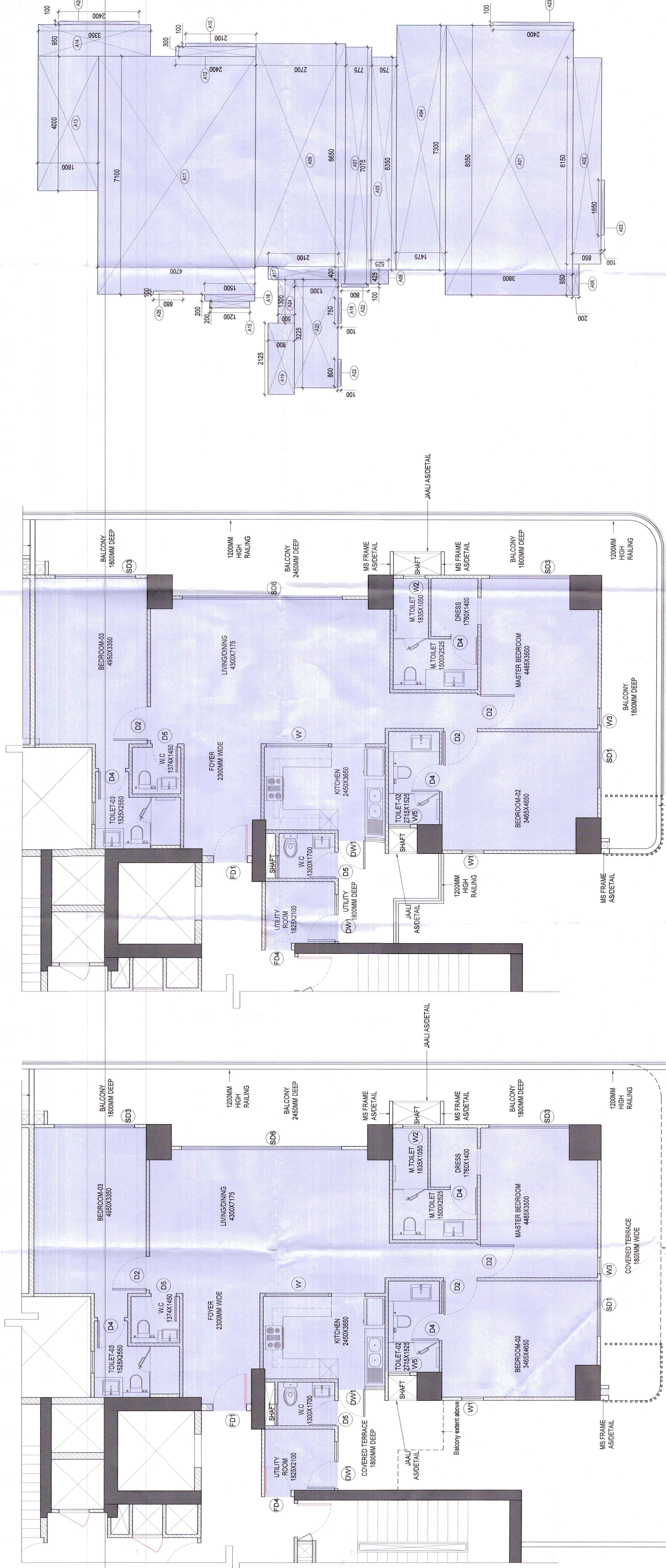
TYPE B: 3BHK