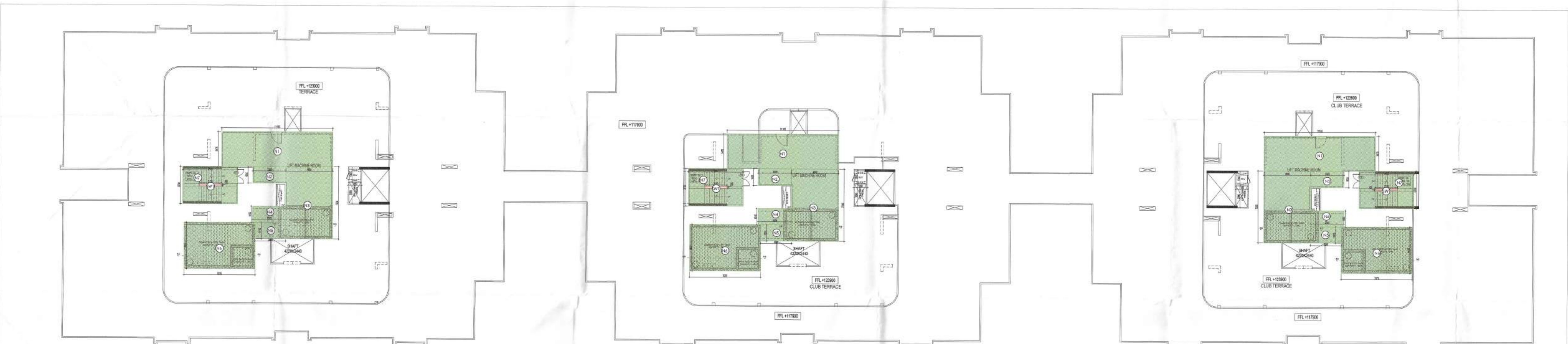
WATER TANK AND MACHINE ROOM AREA DETAIL