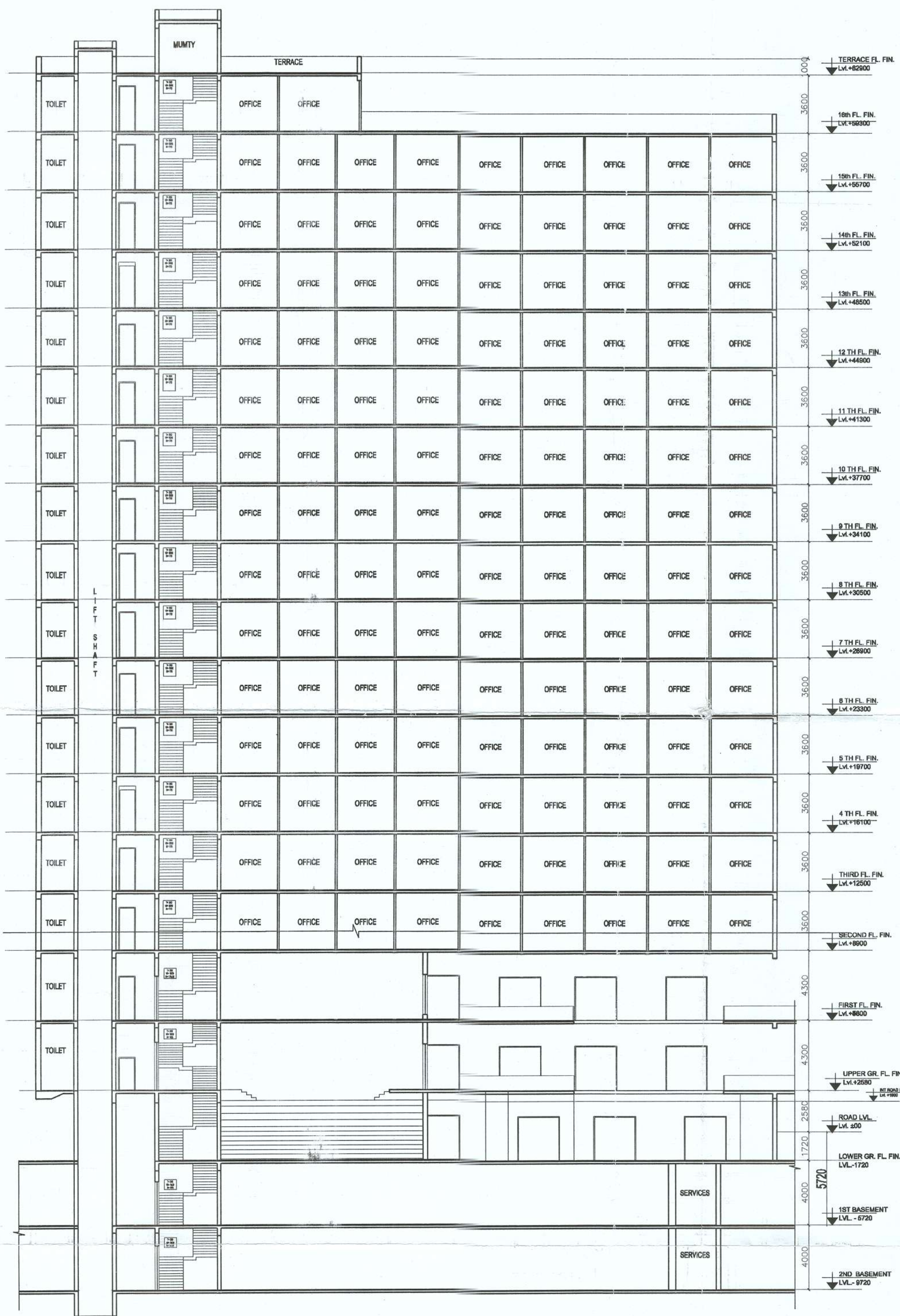
SECTION AT BB