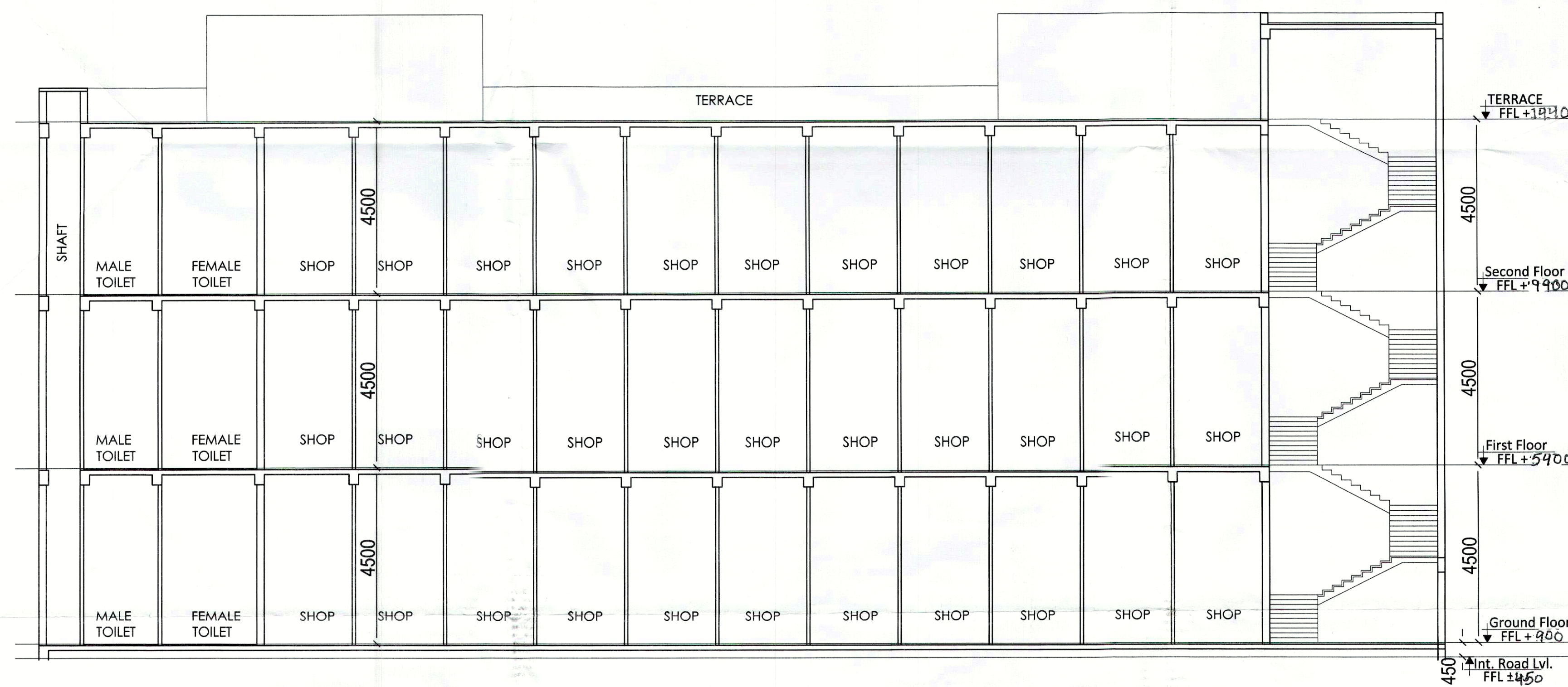
SECTION AT XX'