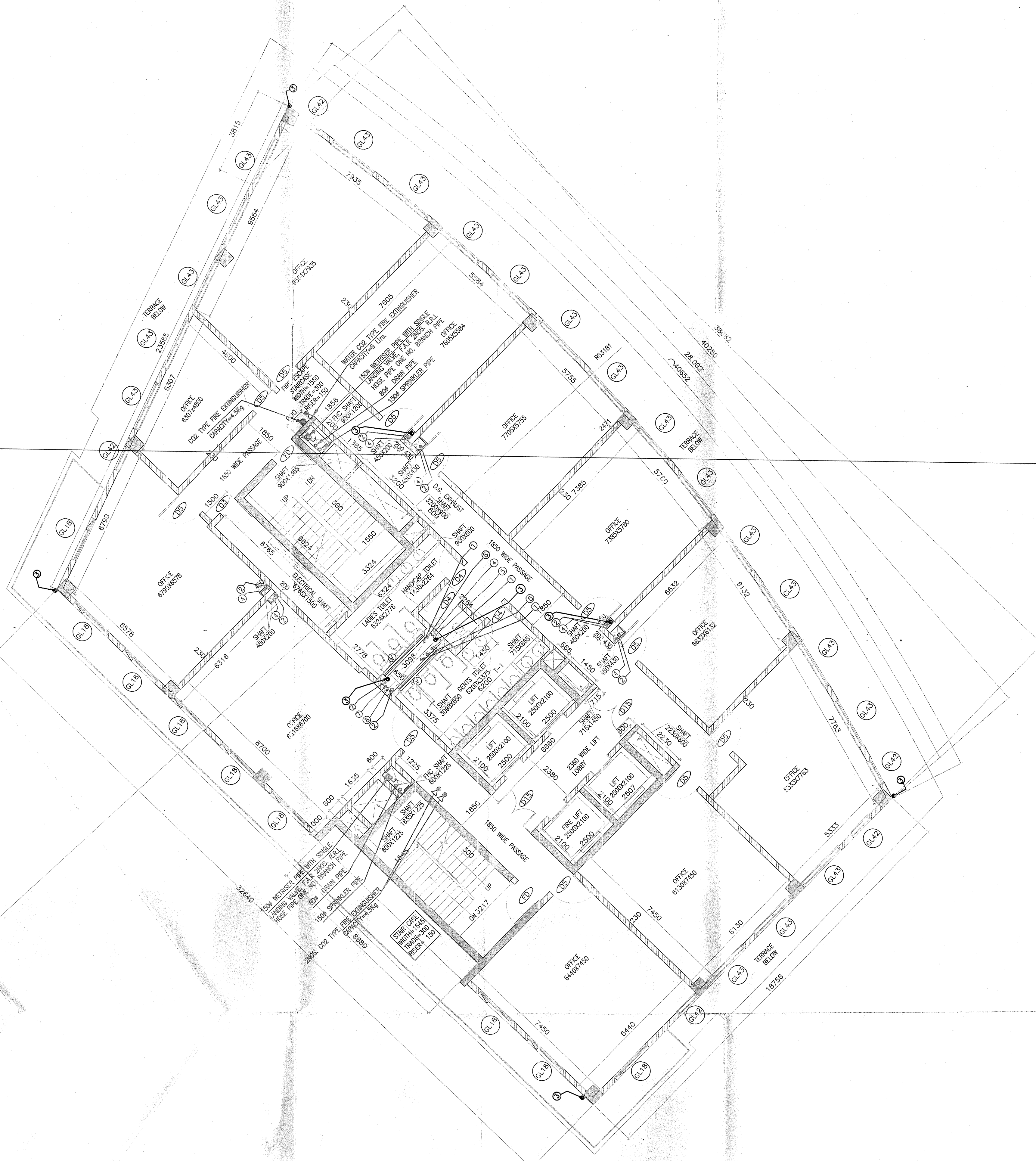
BLOCK-D 14th FLOOR PLAN LVL+52450