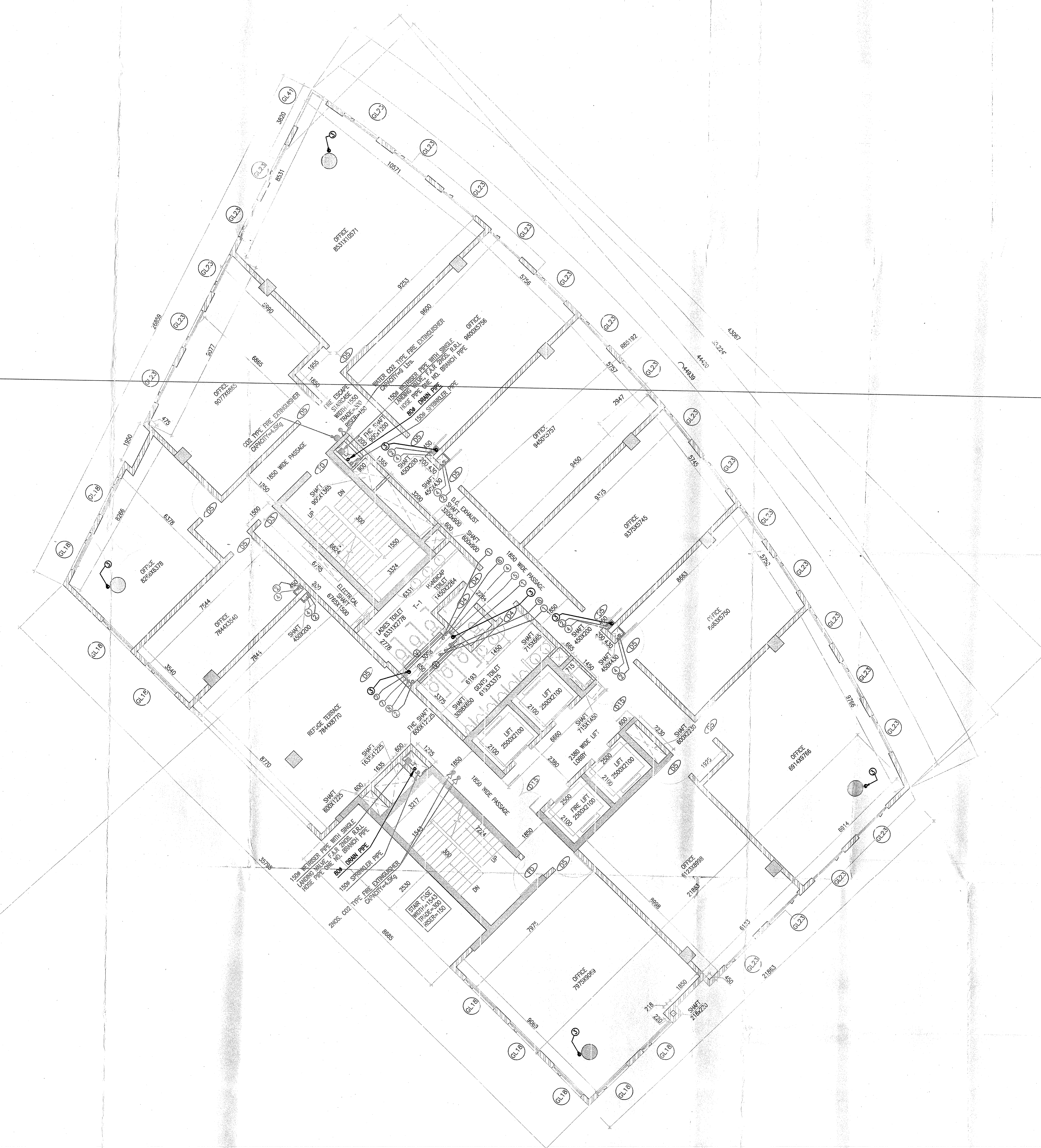
(BLOCK - D) 11th FLOOR PLAN LEVEL +41550