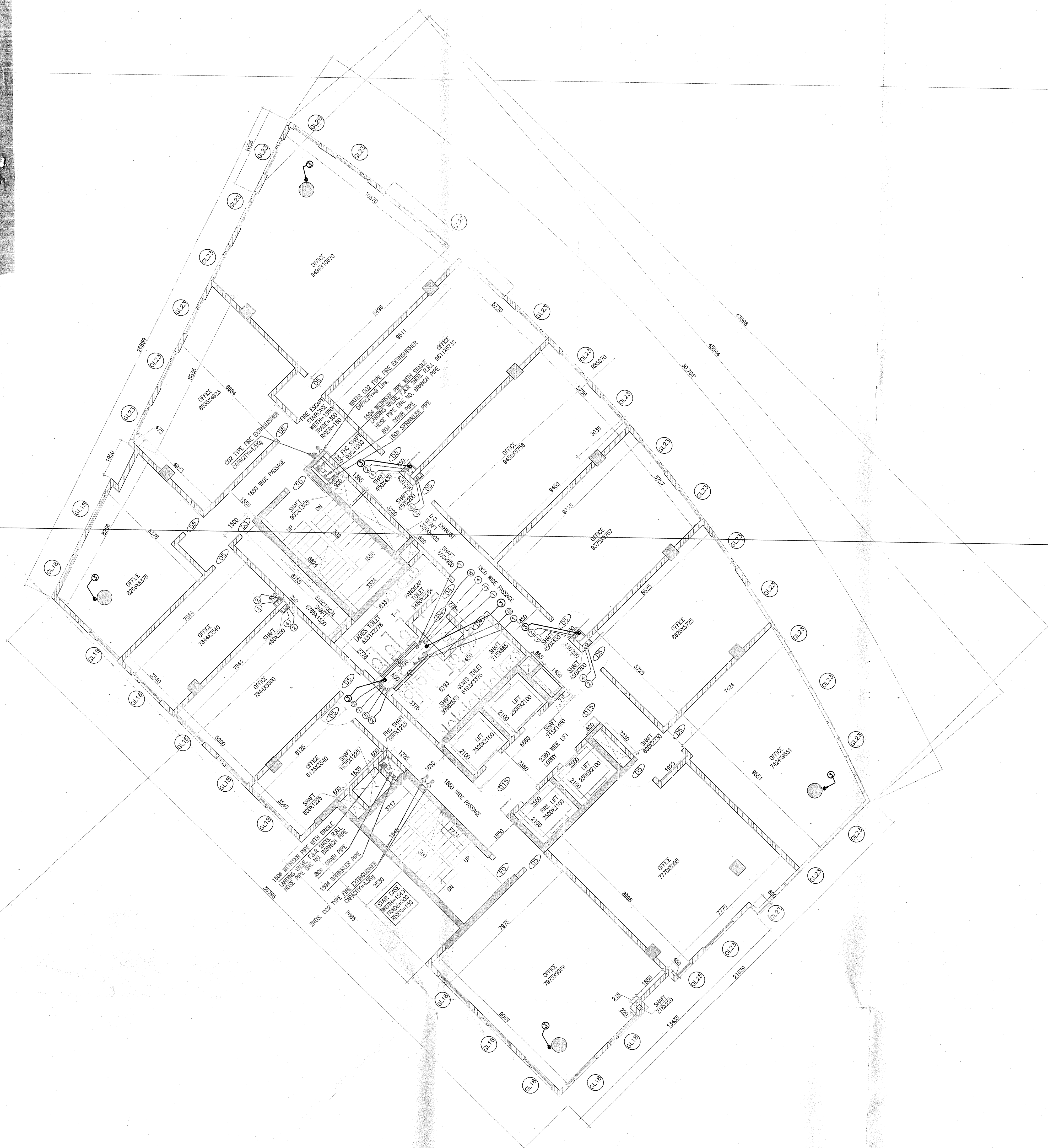
(BLOCK - D) 10th FLOOR PLAN LEVEL +38050