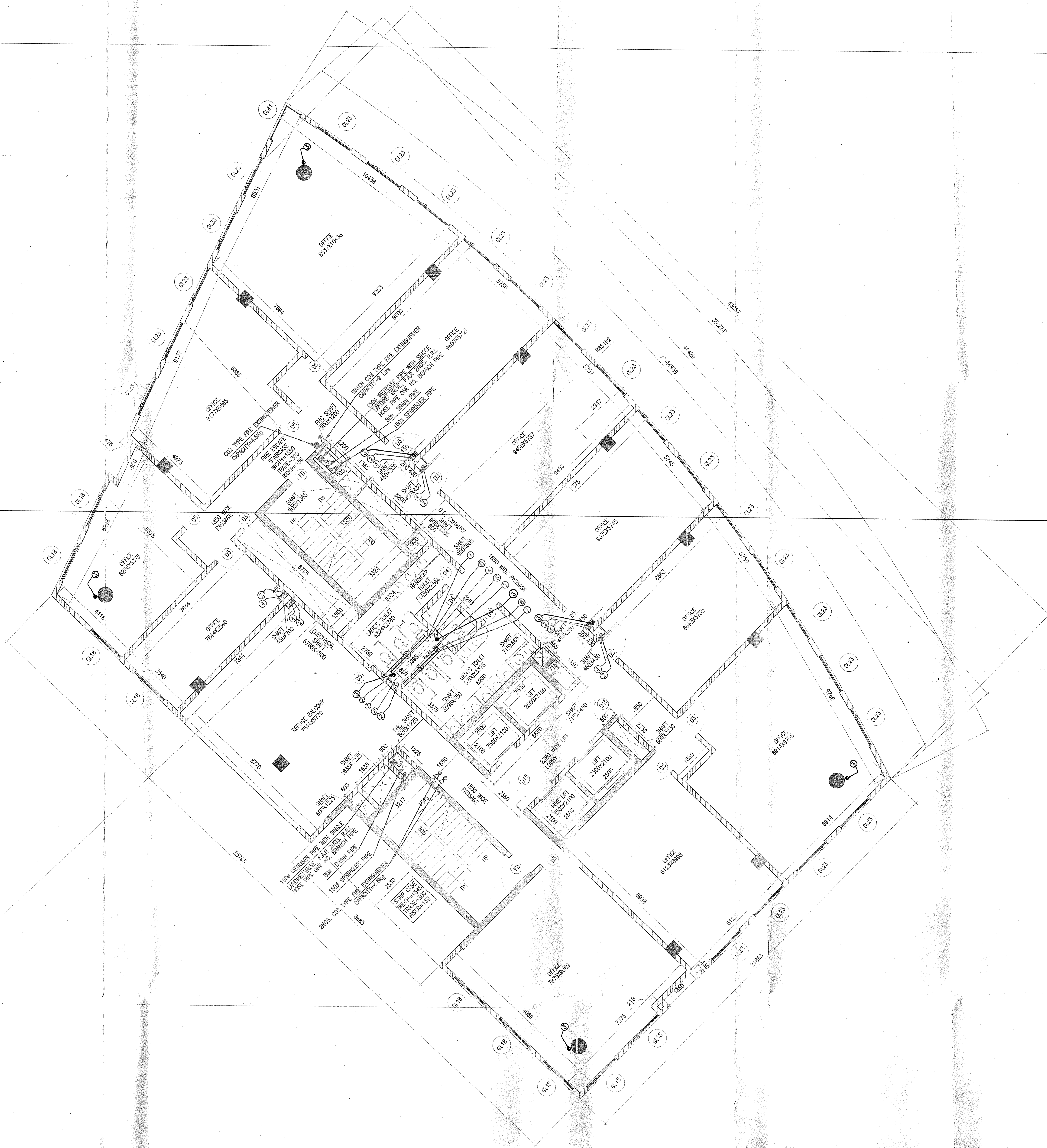
(BLOCK-D) 7th FLOOR PLAN LEVEL +27250