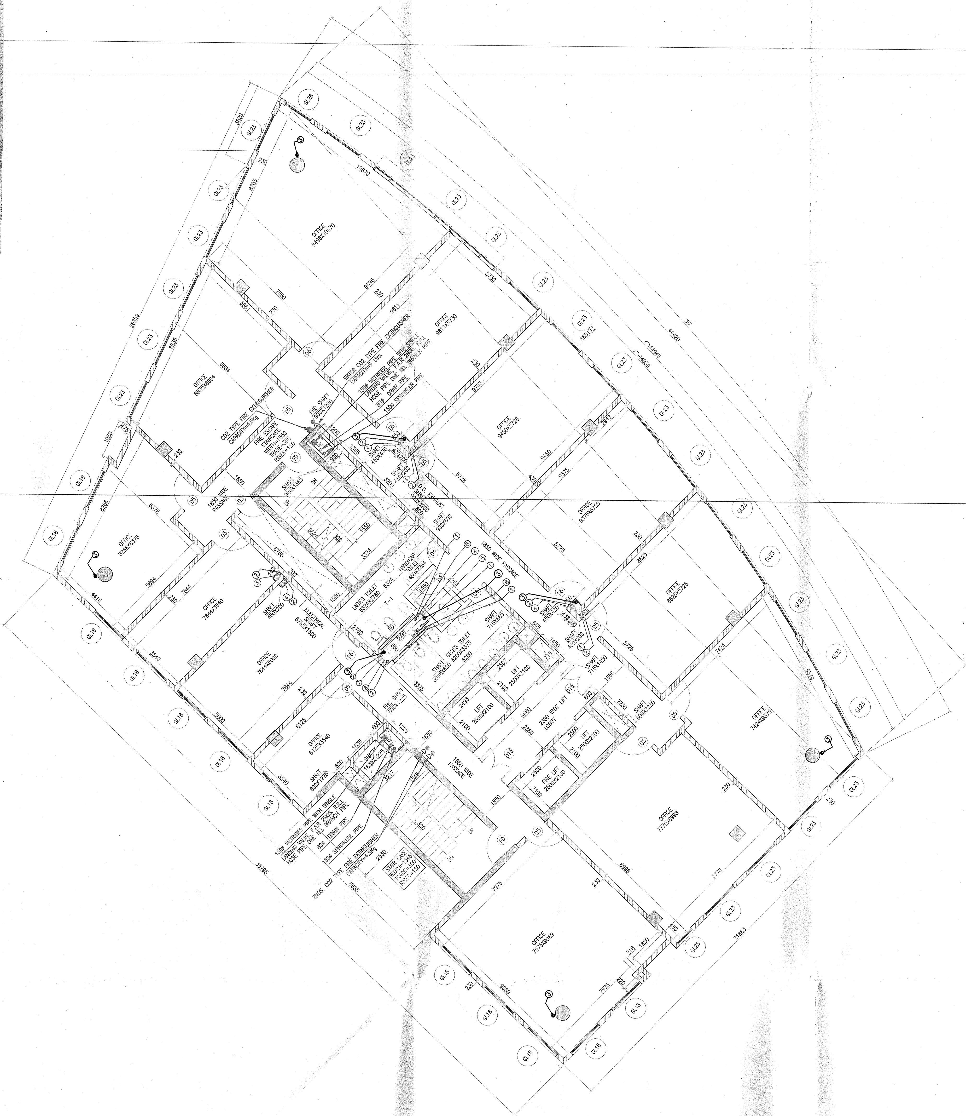
(BLOCK-D) 6th FLOOR PLAN LEVEL +23650