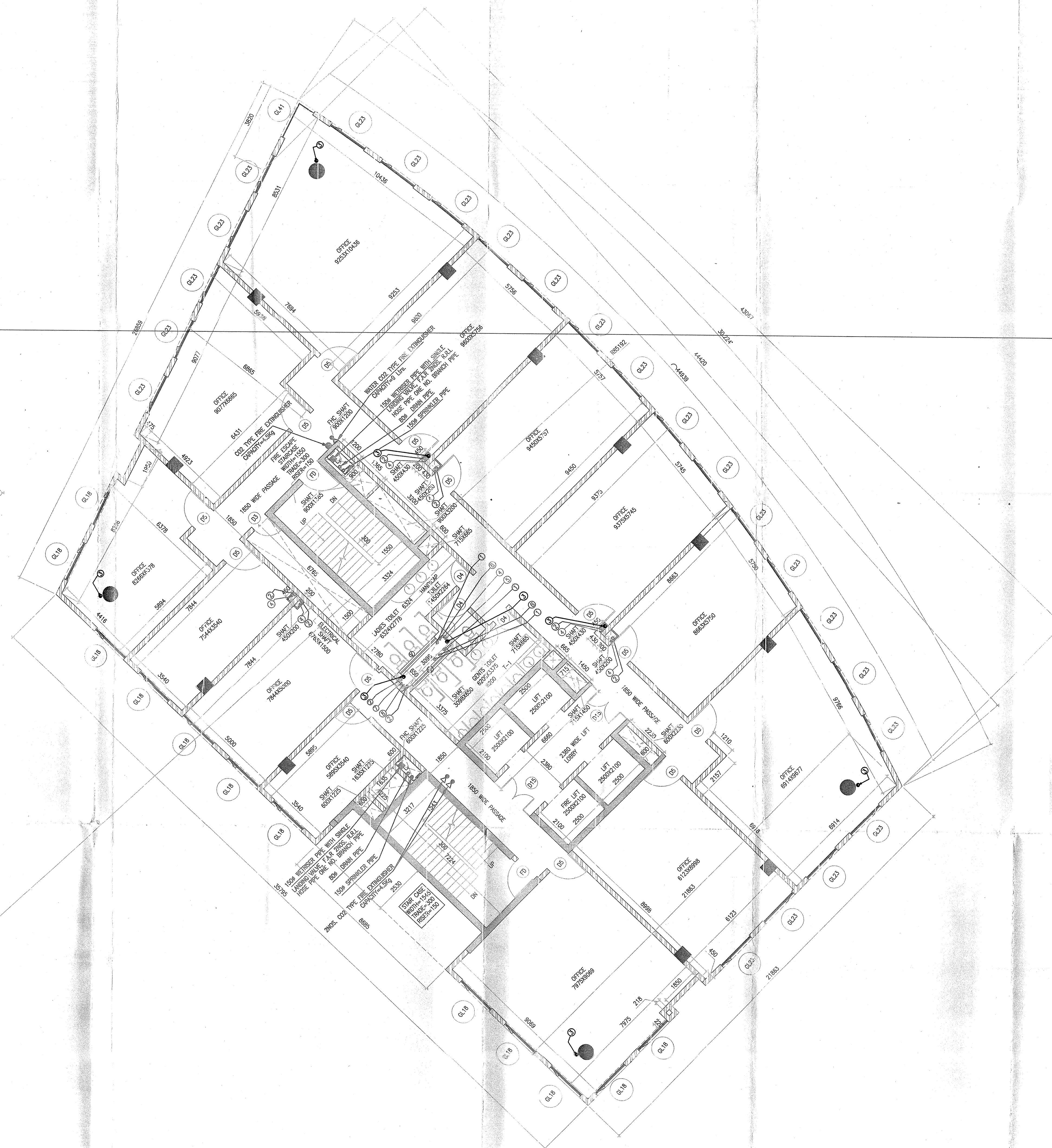
(BLOCK-D) 5th FLOOR PLAN LEVEL +20050