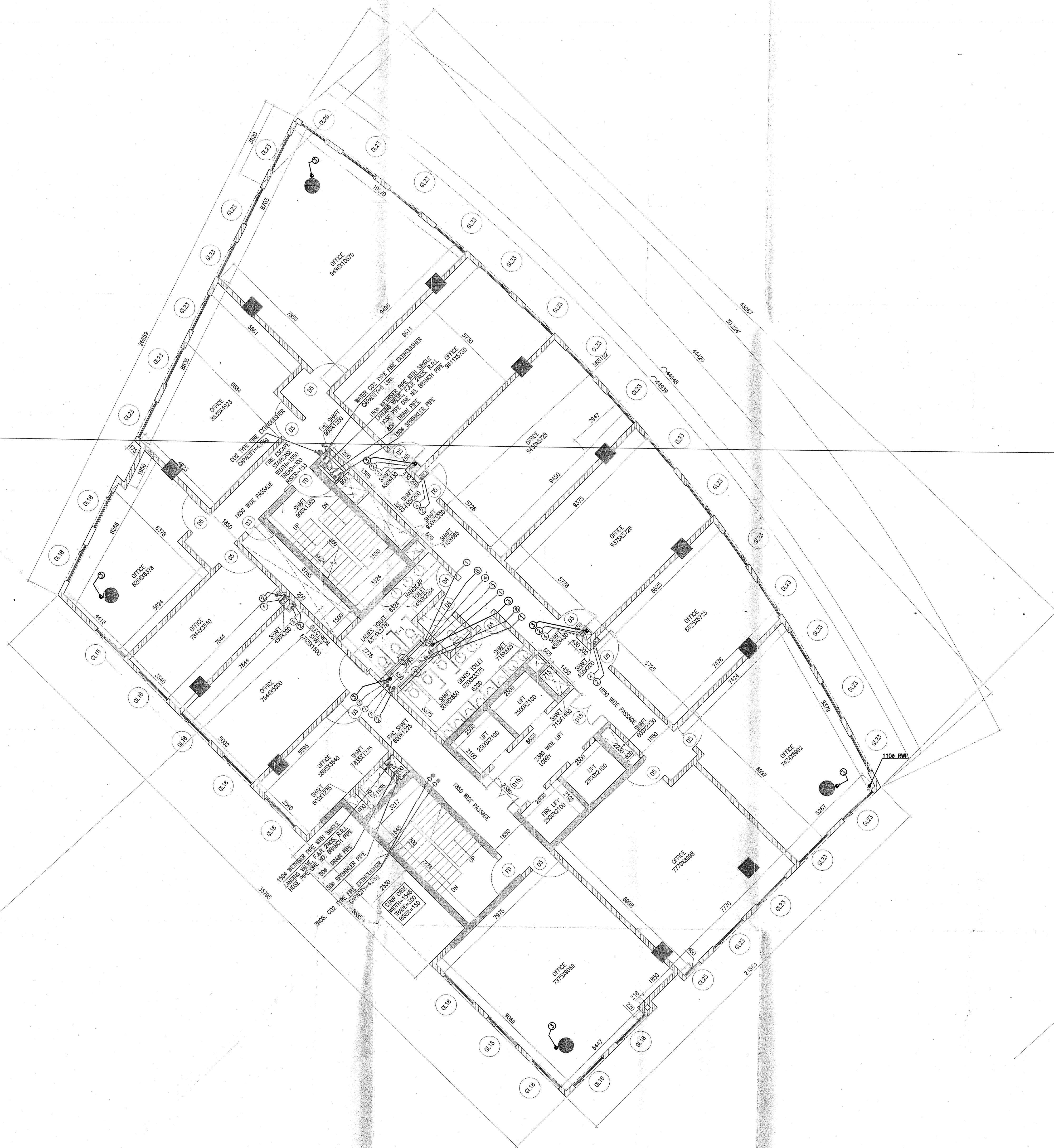
(BLOCK-D) 04th FLOOR PLAN LEVEL +16450