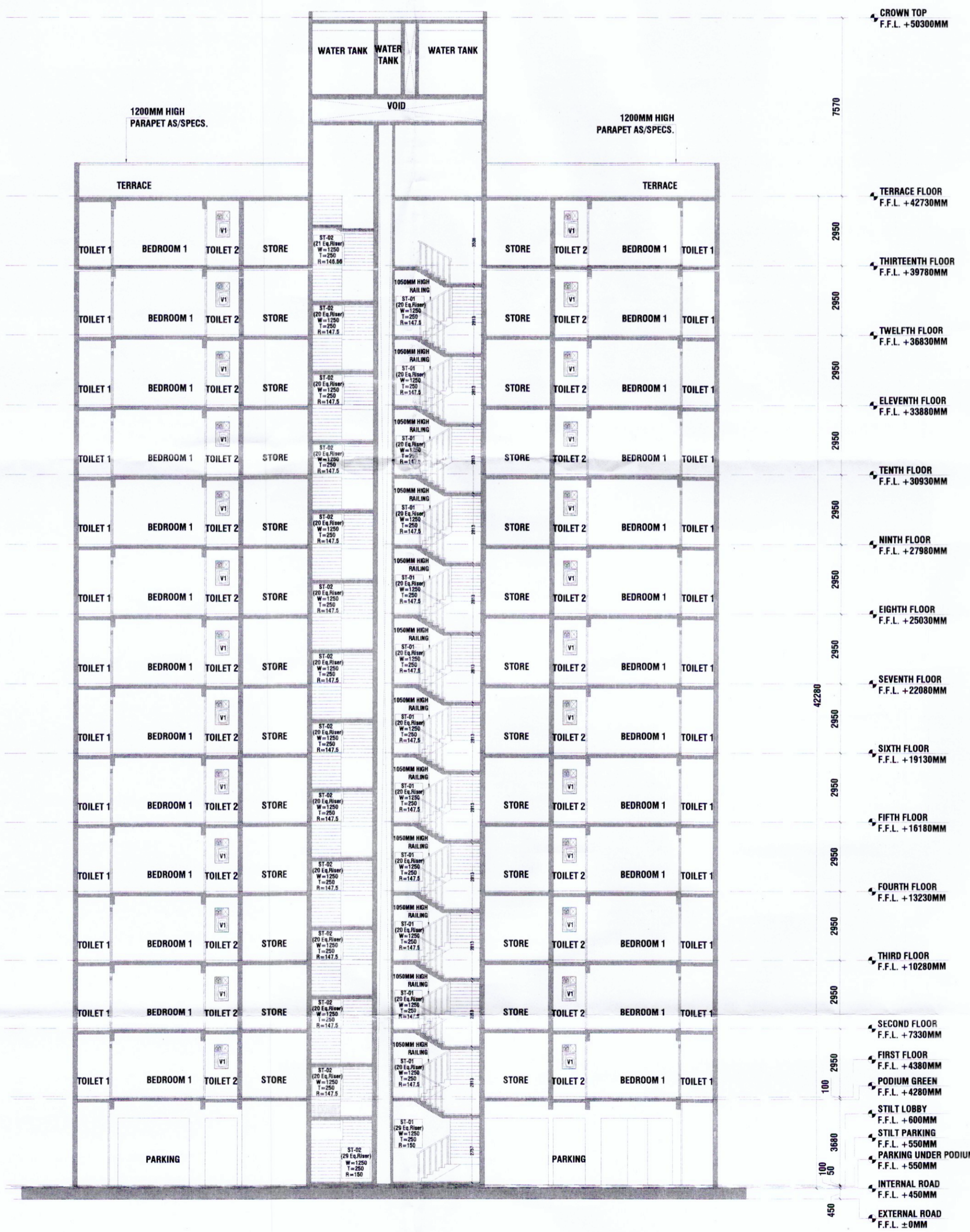
01 SECTION 1