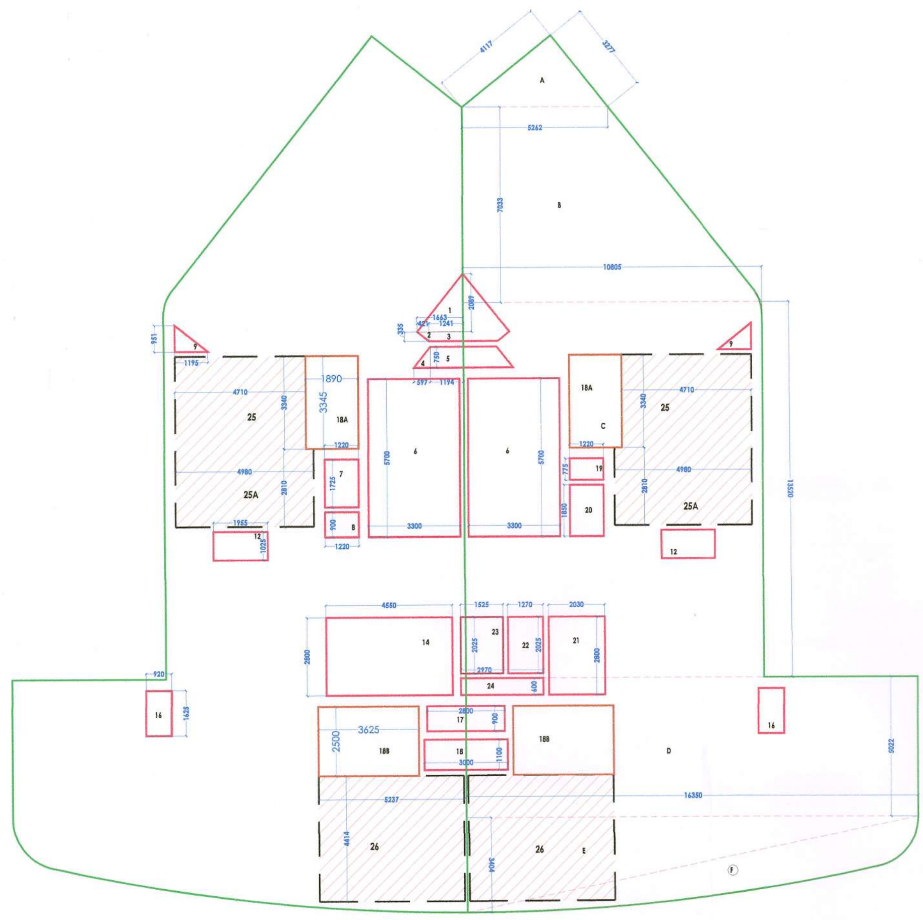
UPPER PENT HOUSE FLOOR PLAN