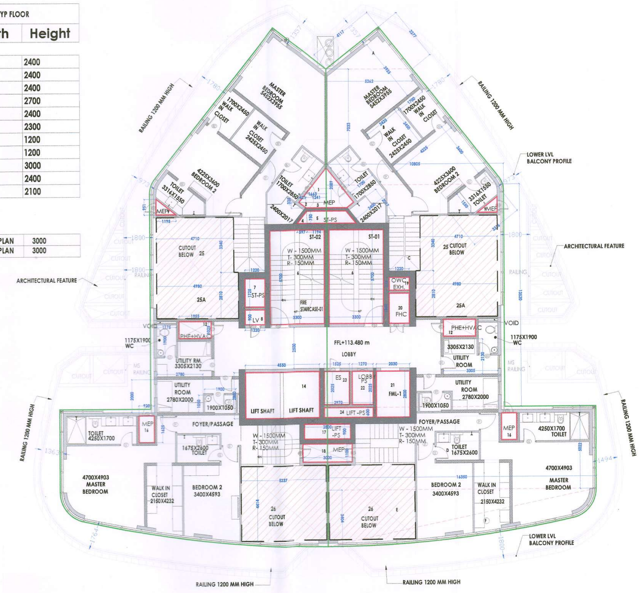
UPPER PENT HOUSE FLOOR PLAN THIRTIETH FLOOR

GSD VARIES AS/PLAN 3000 GSD2 VARIES AS/PLAN 3000