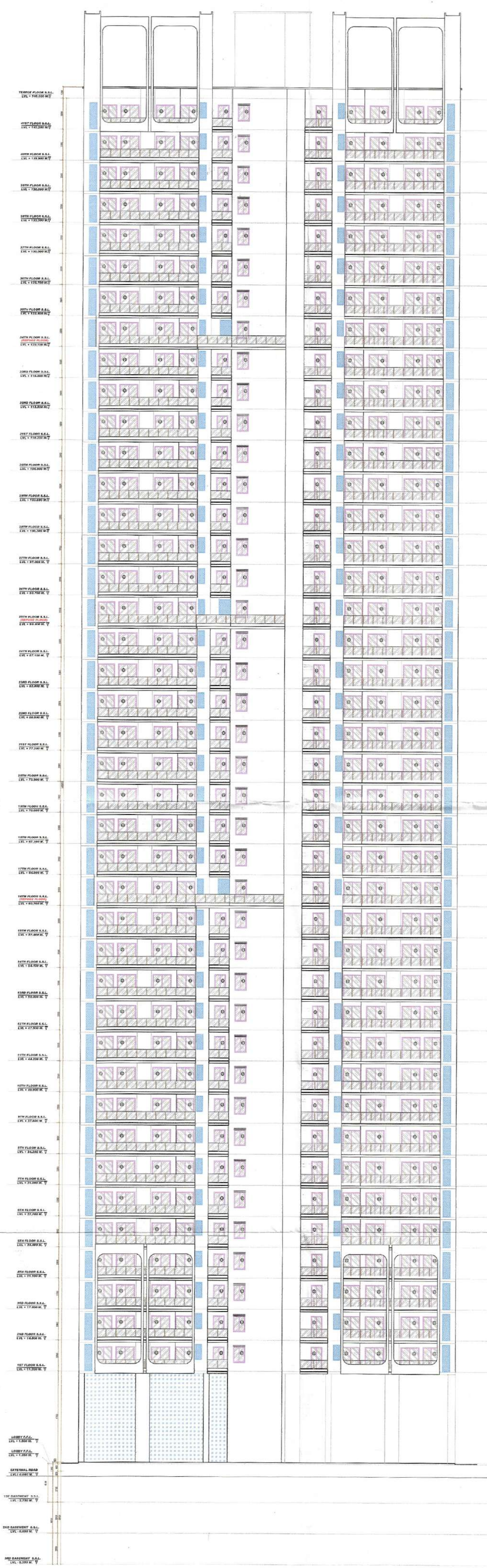
GARDEN SIDE _ (T-9)