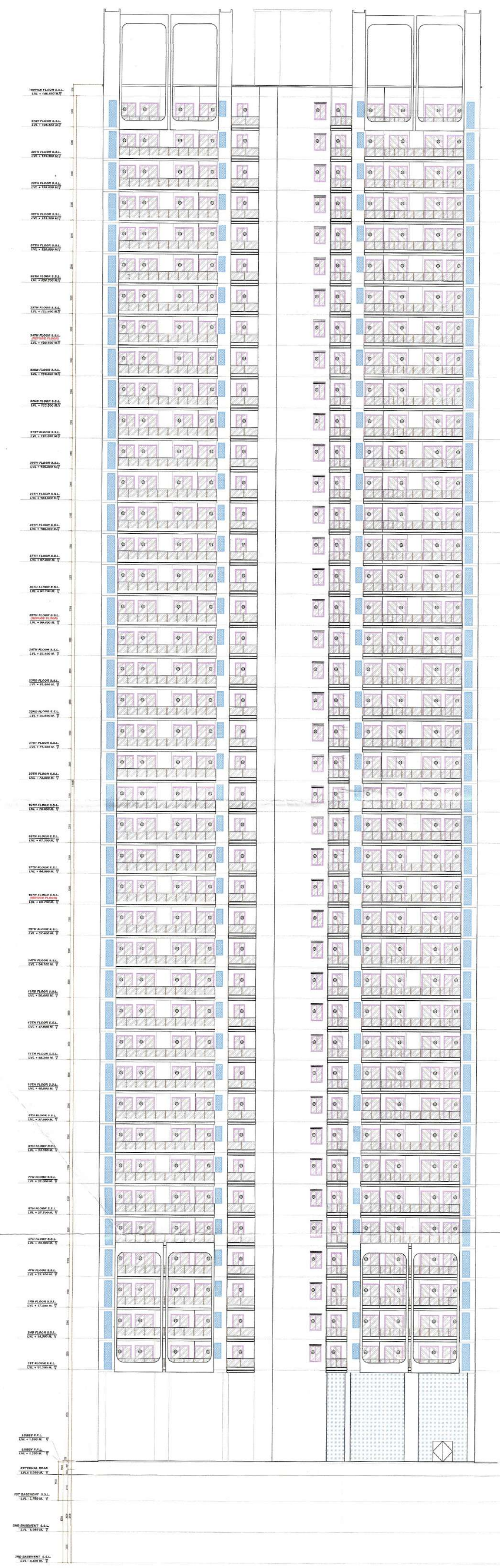
ROAD SIDE _ (T-9)