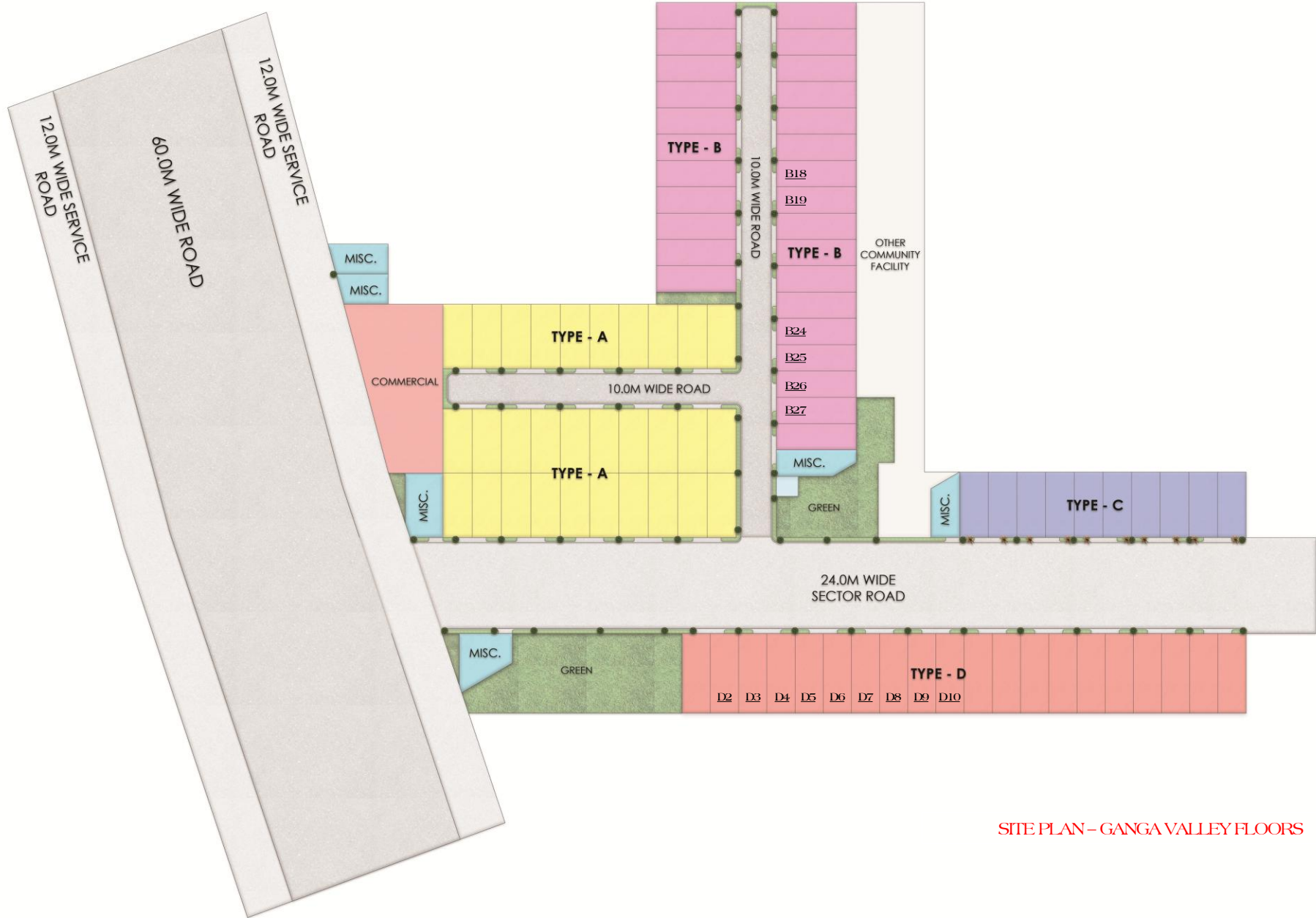
SITE PLAN - GANGA VALLEY FLOORS