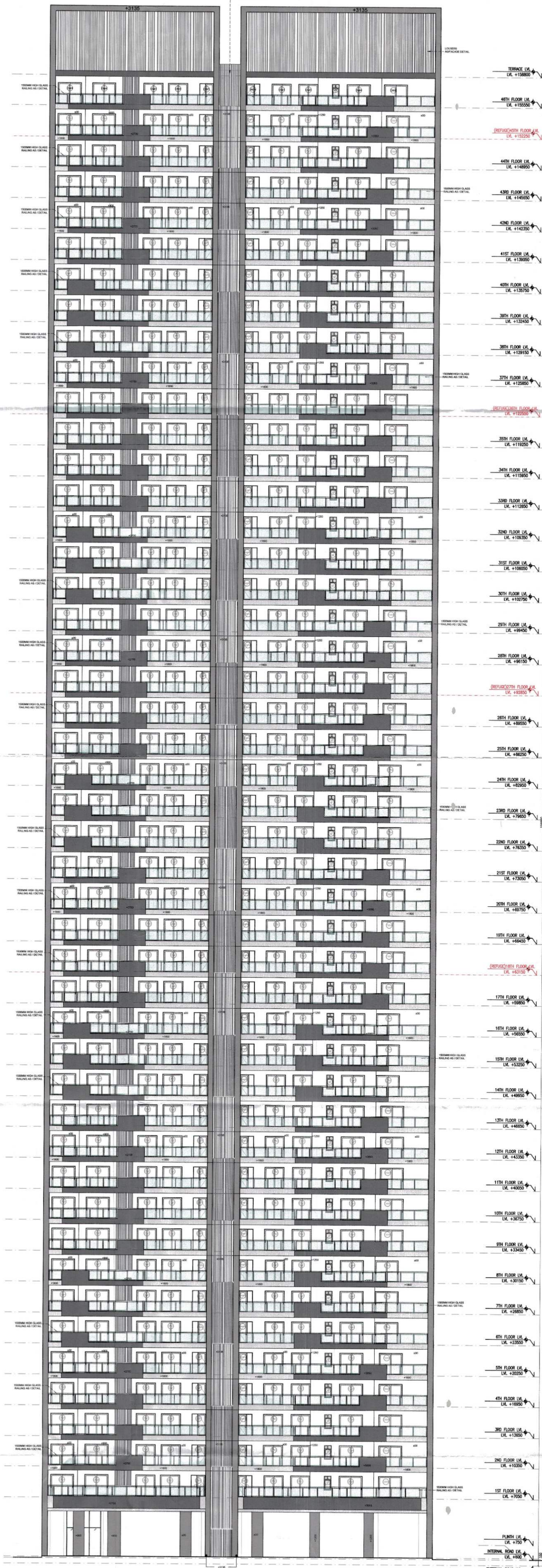
1 TYPICAL ELEVATION- 2-TOWER A & B 1:100