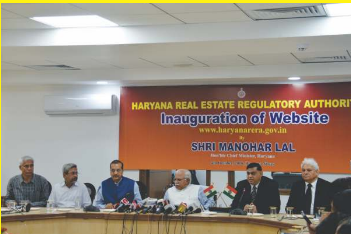
Website of Real Estate Regulatory Authority www.haryanarera.gov.in being Inaugurated by the Hon'ble Chief Minister Haryana on 04-10-2018