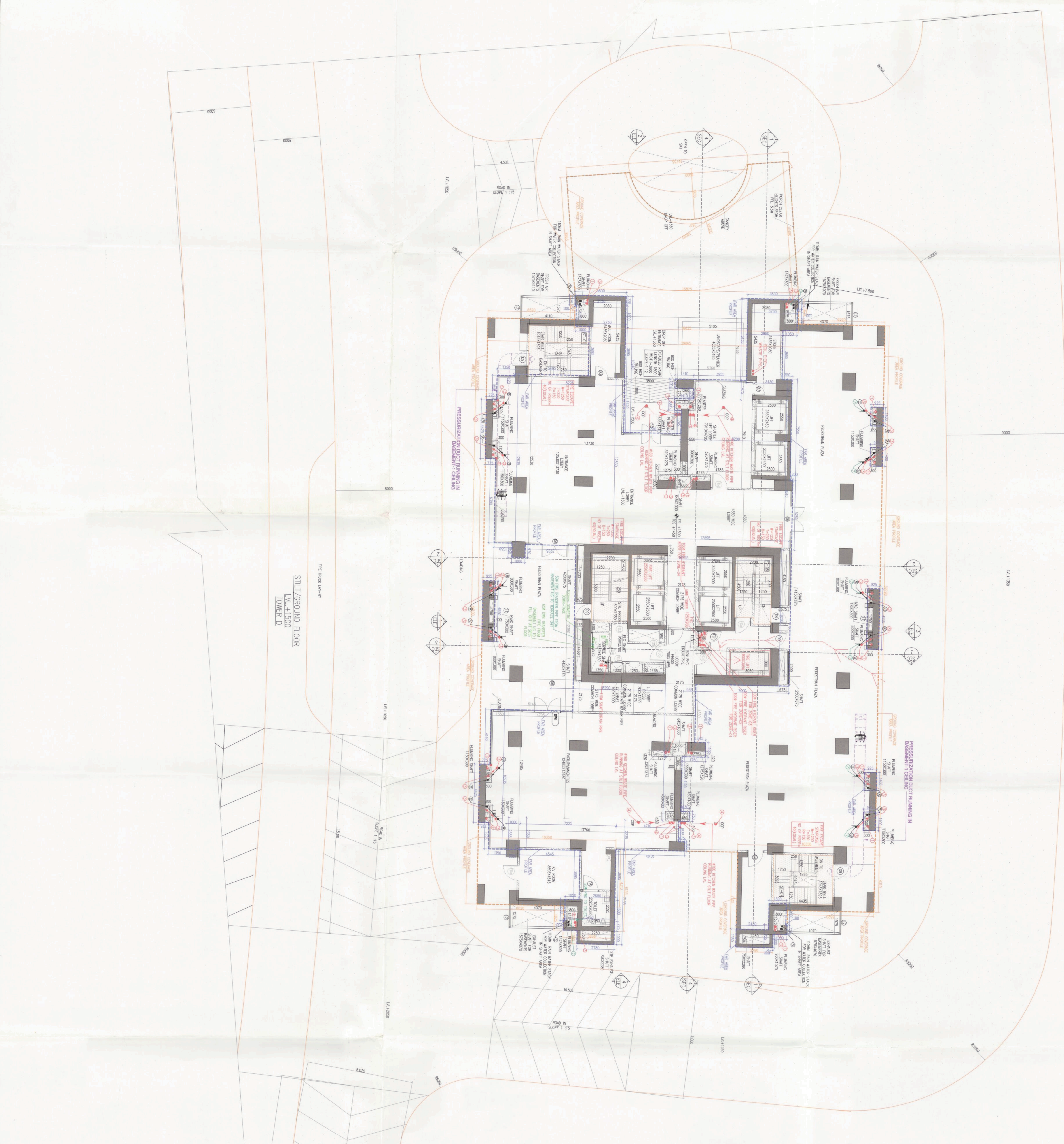
STILL GROUND FLOOR LW 41500 TOWER D