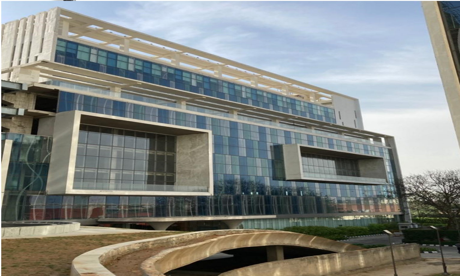
Tower D-East Elevation